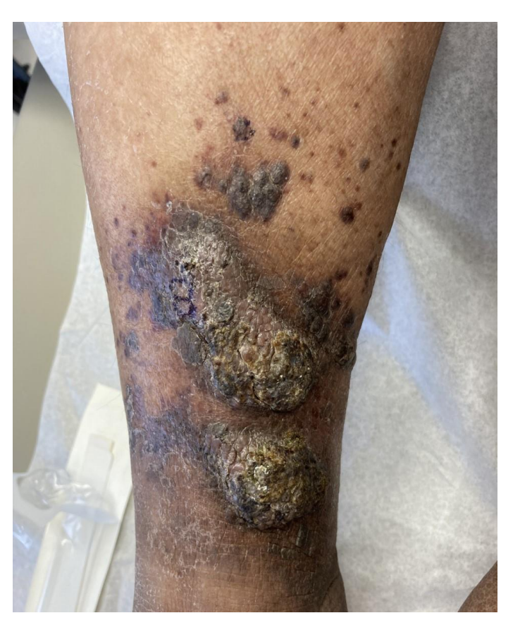
Figure 1 . Verrucous violaceous-brown plaques on the right lower leg with surrounding red-brown papules coalescing into plaques.

present bilaterally consistent with onychomycosis and onychogryphosis. At this visit, two punch biopsies were performed including hematoxylin and eosin staining and tissue culture for aerobic bacteria, acid-fast bacillus, and fungal organisms. Pansensitive Staphylococcus aureus only was grown. On pathology, nodular angioplasia was seen with tufts