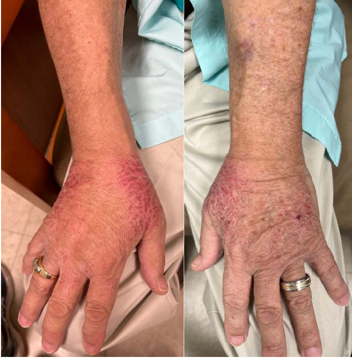
Figure 1. Erythematous scaly plaques symmetrically distributed on the medial and lateral aspects of the bilateral dorsal hands.