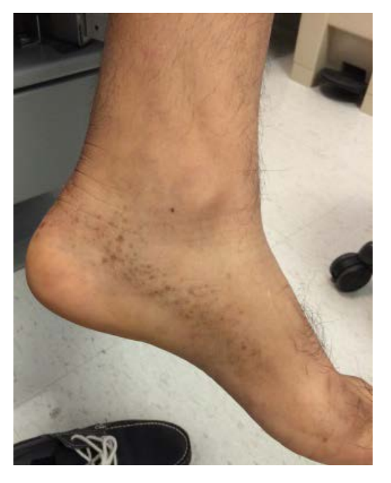
Figure 1. Keratotic papules along sole margin

Histopathology : There is hyperkeratotic compact orthokeratosis. Within the dermis, a Verhoeff-van Gieson stain shows thinning and fragmentation of elastic fibers.