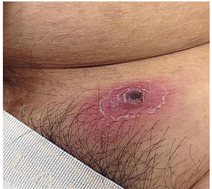
Figure 1. Variably-sized, erythematous papules and nodules with central eschars and peripheral scale were present on the arms, legs, and suprapubic area.

fluorodeoxyglucose uptake that was associated with skin thickening in the medial aspect of the left upper thigh.