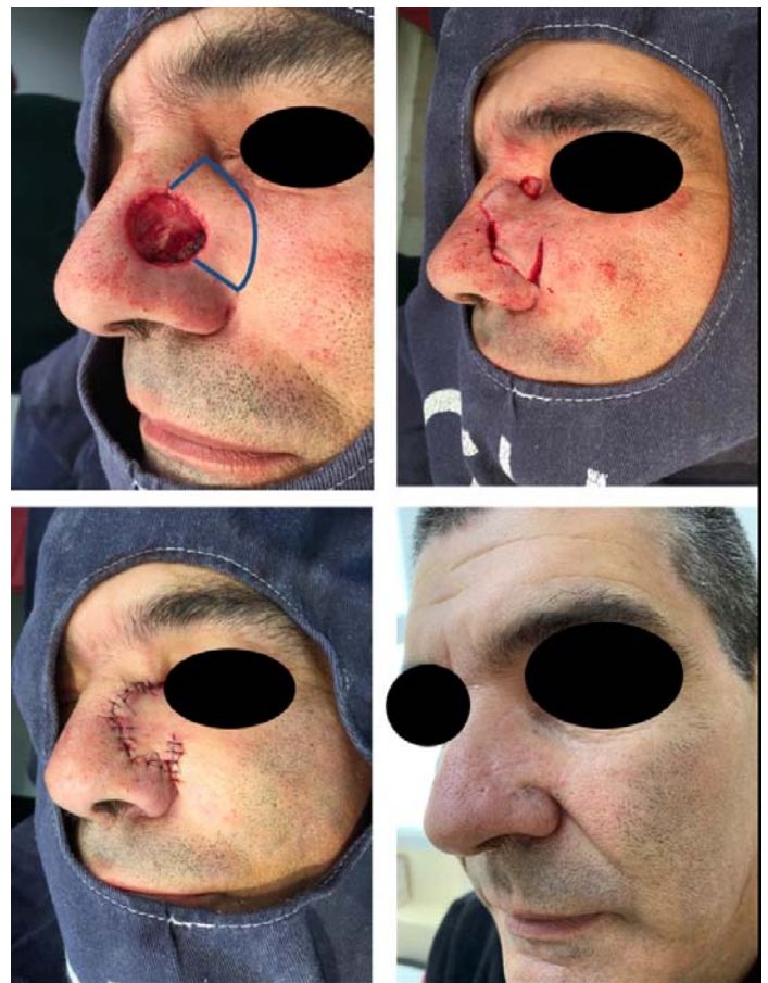
Figure 1. A) Surgical defect of 2.1 centimeters of diameter and delimitation of modified keystone flap technique. B) Advancement of the island that shows how it covers the entire defect with minimal tension. C) Immediate post-surgery defect repaired. D) Barely-visible scar one year after the procedure.

described with good outcomes. We present a case in which the modified keystone flap is used to repair a MMS surgical defect in a patient with a BCC on the nose.