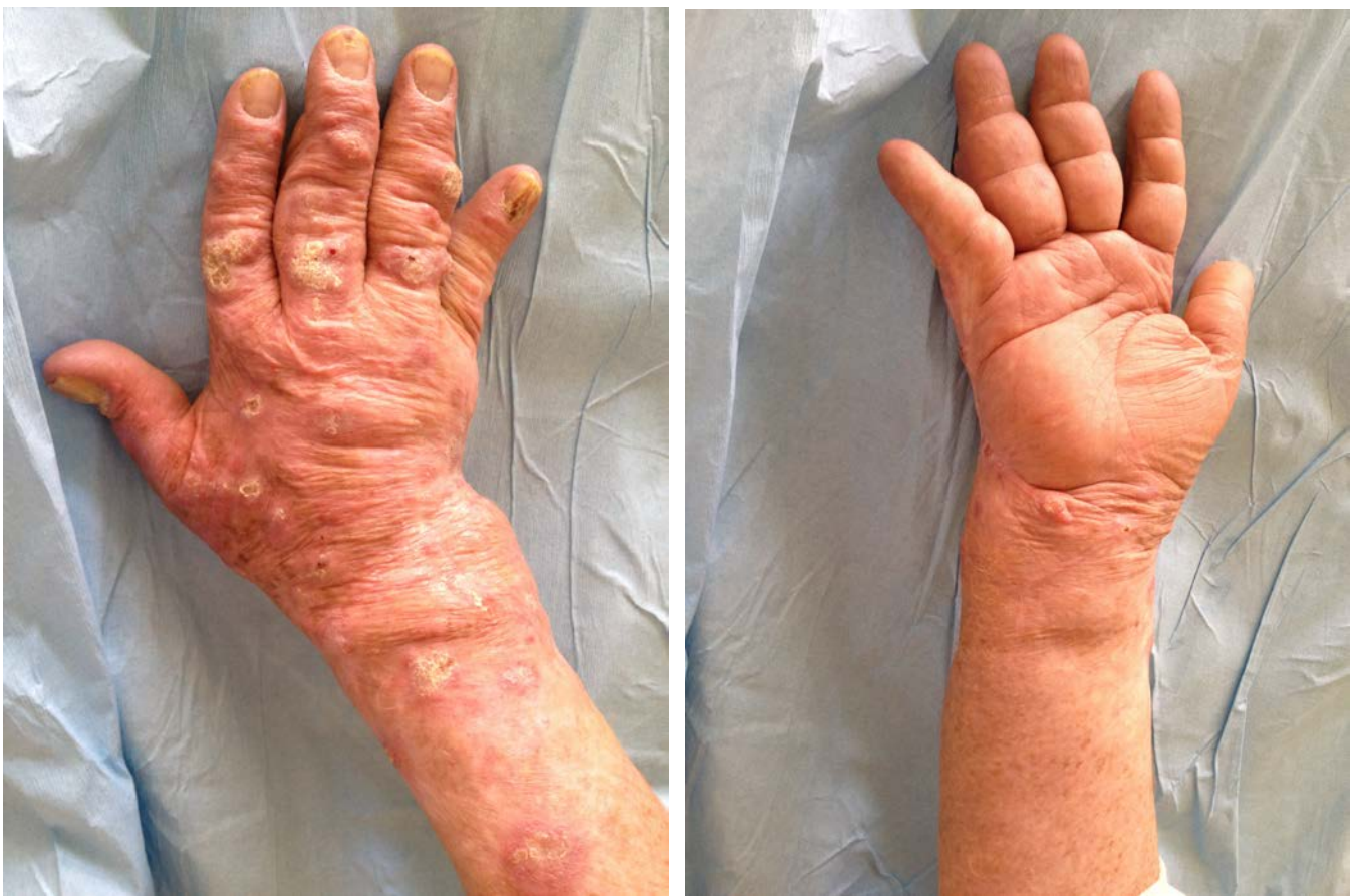
Figure 7. regression of vegetated lesions on back of hand and forearm of the right upper limb