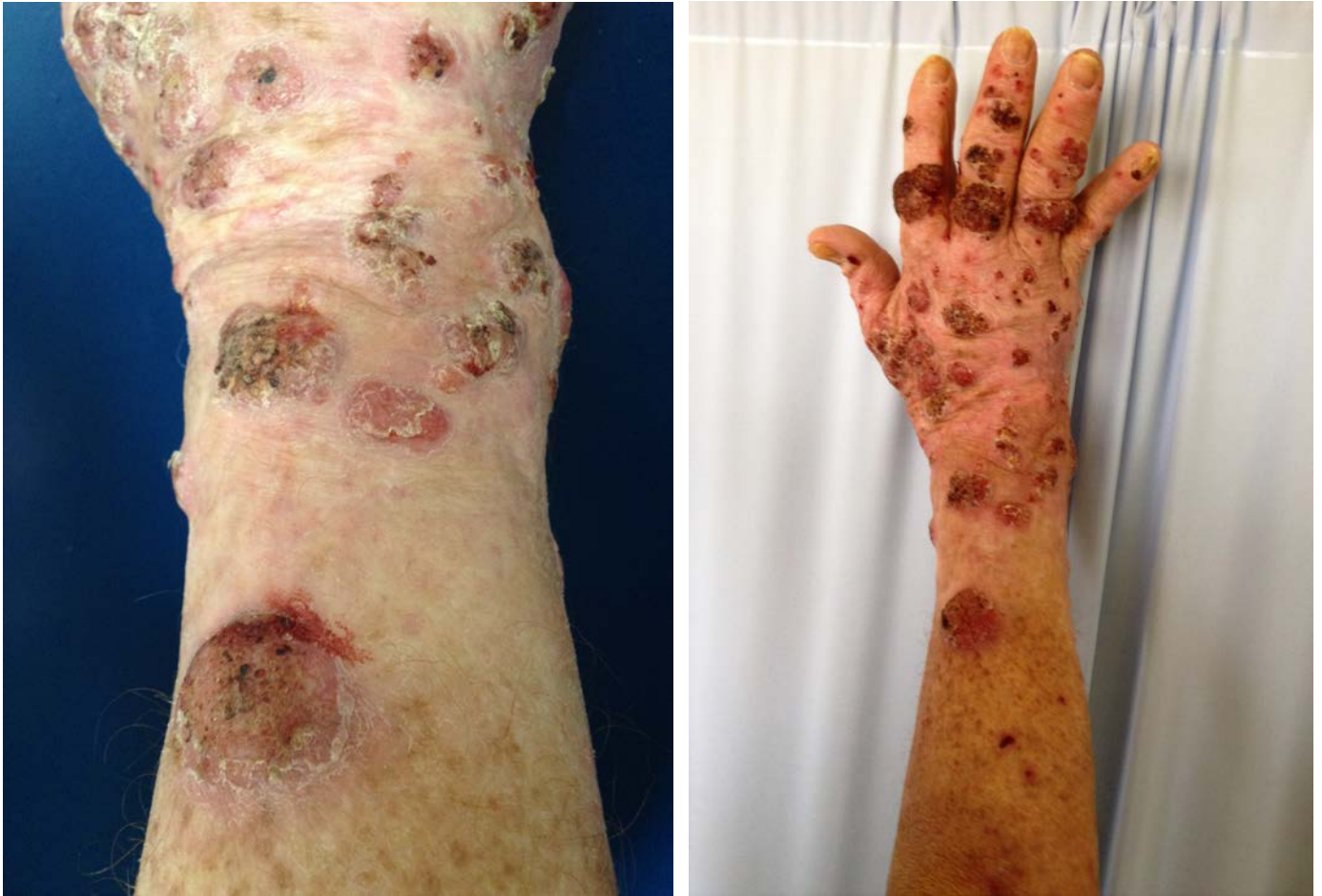
Figure 1. Vegetative nodules and plaques on right dorsal hand and forearm

which were derived from short branches with elongated spores at the ends. Short chains of spores or sometimes apical serrations were present (Figure 6). These aspects were suggestive of Fonsecaea pedrosoi species.