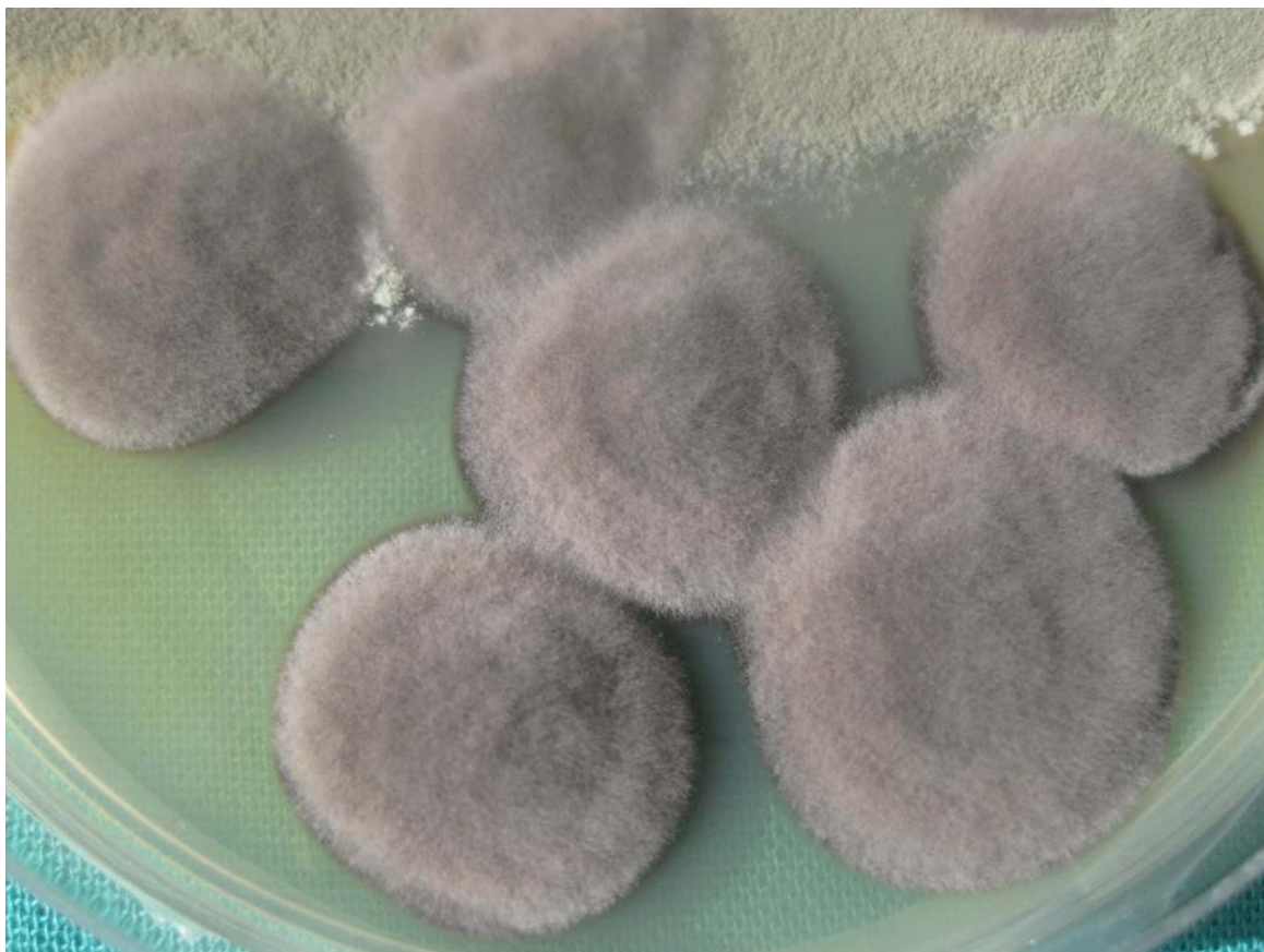
Figure 4. Examination of colonies in potash at 20% showed fungal cells