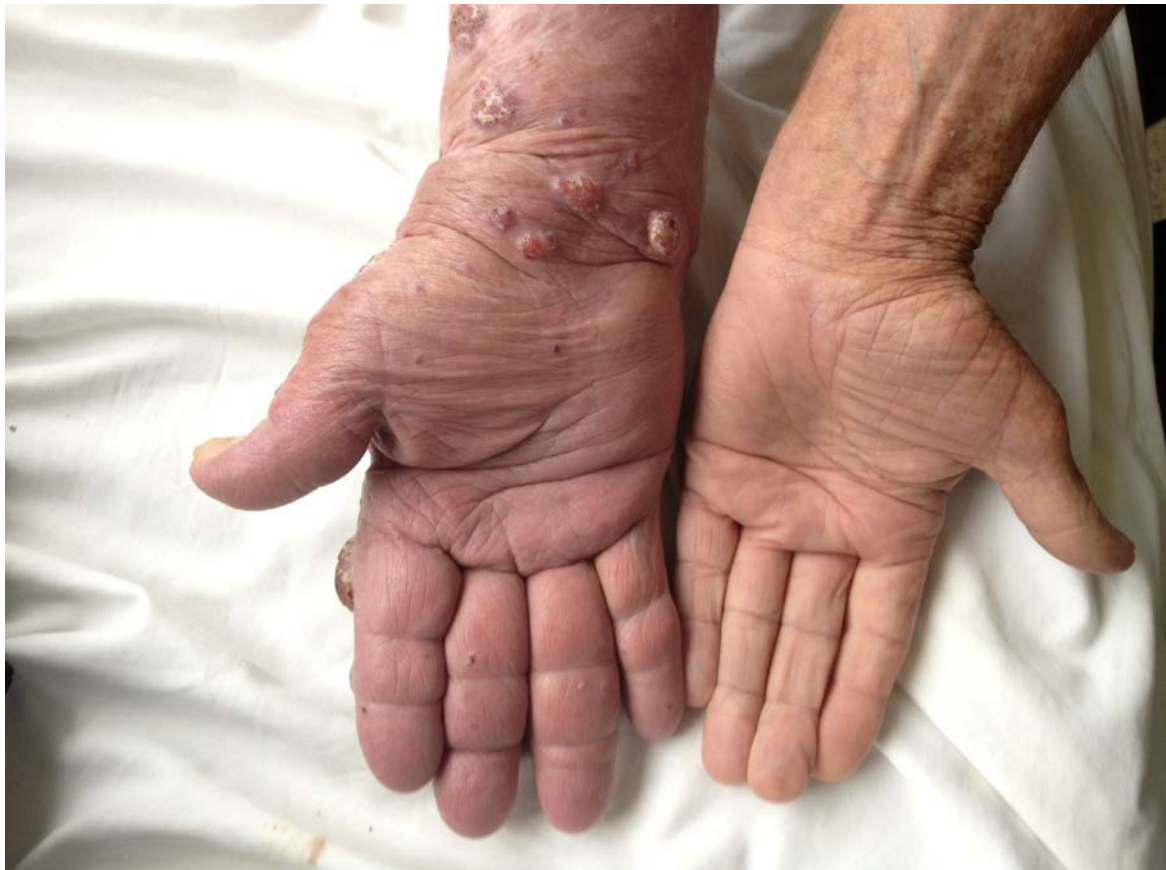
Figure 3. Nodules and lymphedema of the right upper limb