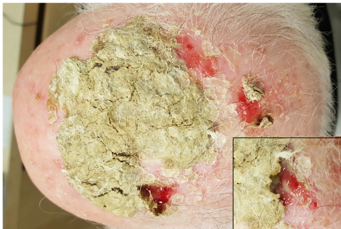
Figure 1. Thick hyperkeratotic yellowish plaque on the scalp of our patient, after three months of treatment with gefitinib 250mg once daily for metastatic non-small cell lung cancer. Inset, the gentle curetting of the scalp revealed numerous coalescent pustules, draining purulent material.

Erosive pustular dermatosis of the scalp is an uncommon condition mainly affecting elderly Caucasian men with prolonged sun exposure on the scalp. The course is slow and progressive over months or years. The patient generally presents with sterile pustules involving large areas of the scalp and