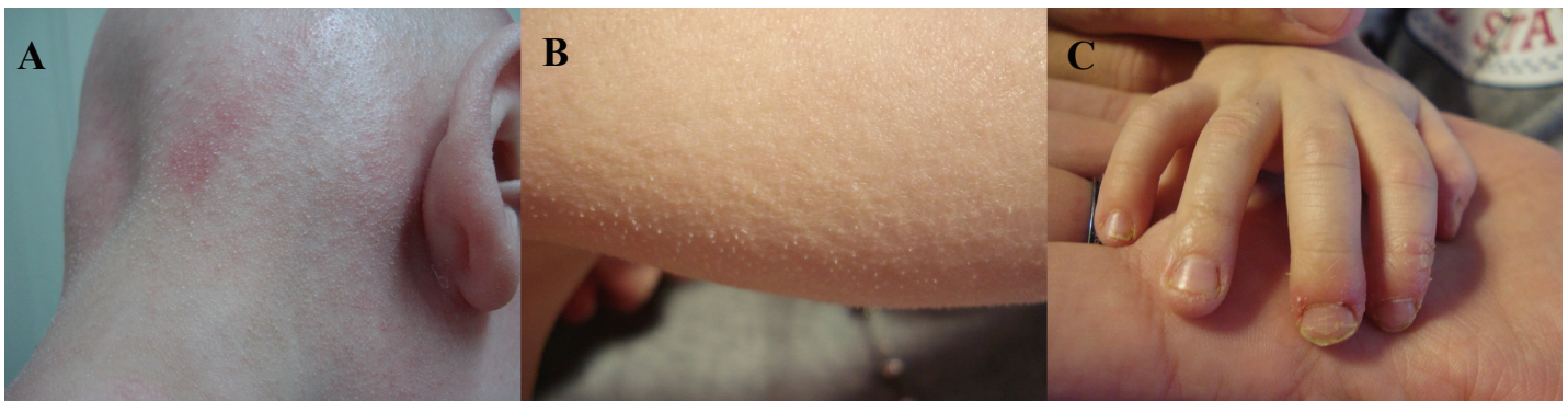
Figure 1. A, B) Spiny hyperkeratotic papules localized on the scalp and left arm. C) Dystrophic nail with periungual erythema.

The patient's height was below normal for his age. Dysgeusia was also observed. Ophthalmic examination revealed keratitis and corneal neovascularization. The pathology of follicular papules showed follicular keratosis. The genetic study found a mutation in the gene MBTPS2 E11 homozygous c. 1433 C> A, p. 478 A>D. This mutation had not been reported previously. These data confirmed the presumptive diagnosis of IFAP syndrome. The patient was treated with levothyroxine, general humectant measures, and eye lubrication.