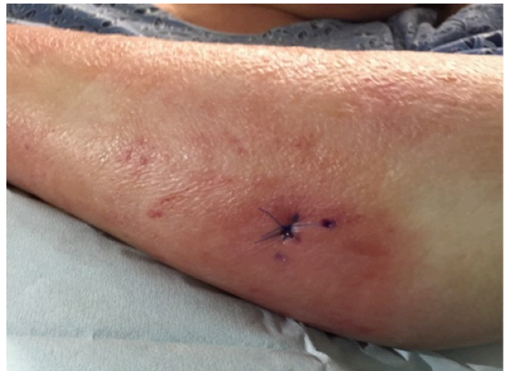
Figure 1. Tender erythematous nodule at biopsy site on left forearm.

Prior to admission, she was seen by an outpatient dermatologist. A punch biopsy of a tender pink nodule on the right medial thigh was performed, which showed superficial and deep perivascular interstitial infiltrates composed of lymphocytes and small aggregates of histiocytes forming granulomas. The process extended into the subcutis showing panniculitis, but the sample size limited the ability to determine a septal versus lobular process. Stains