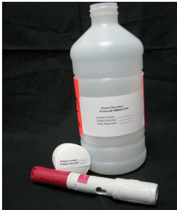
Figure 1. MEMs bottle

Keywords: depression, pruritus, insomnia, sleep, sleep quality, psoriasis