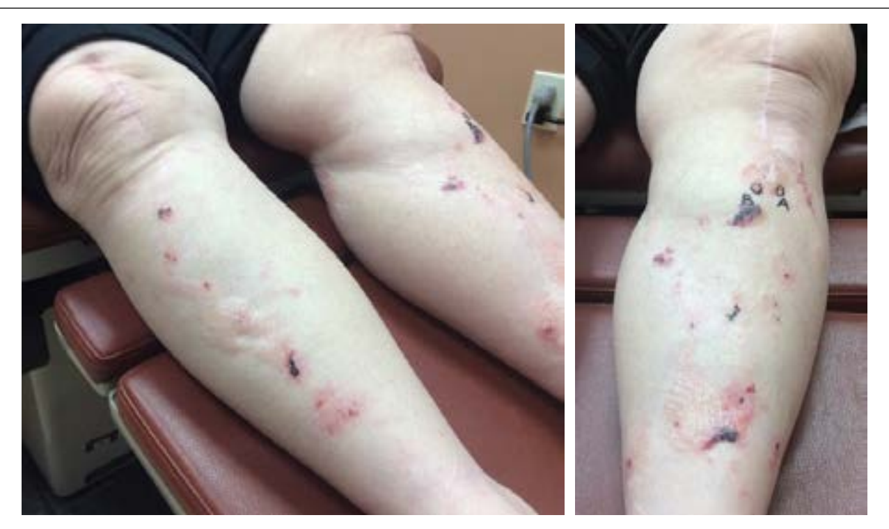
Figure 1. Clinical image of right and left anterior lower legs demonstrating hemorrhagic bulla, atrophic epidermis, and erythematous plaques.