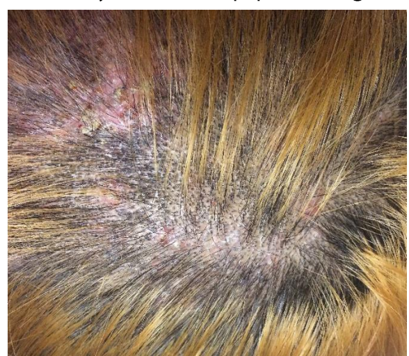
Figure 1 . On examination, the patient had broad patchy alopecia with yellow scale and excoriated erythematous papules. A fungal culture isolated Trichophyton tonsurans.

A 38-year-old Hispanic woman presented with a pruritic full body rash and patchy alopecia of three years' duration. The patient's medical history was remarkable for chronic hepatitis C, cryoglobulinemia, diabetes mellitus type I, and end stage renal disease on dialysis. On physical examination, she had widespread, somewhat gyrate, erythema. On the nape of the neck and the scalp, she had broad patchy alopecia with yellow scale and excoriated erythematous papules ( Figure 1 ).