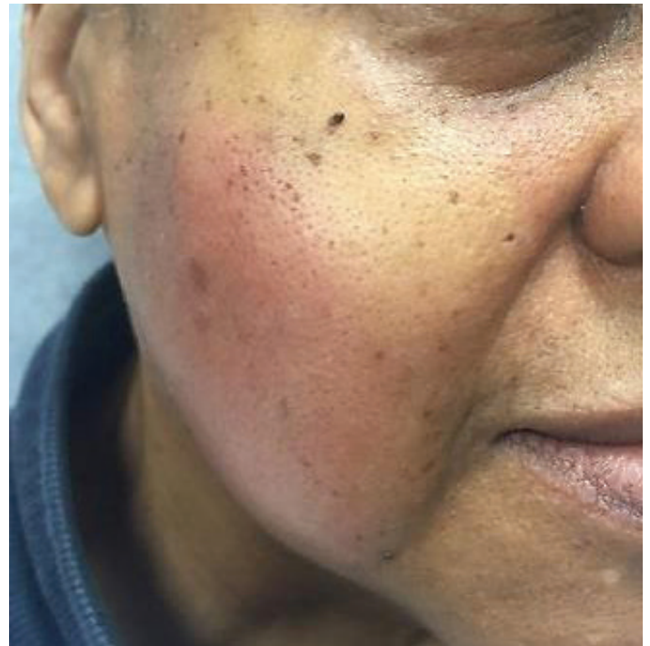
Figure 1. Right cheek with extensive dermal edema and erythema.

We report a 68-year-old woman with chronic lymphocytic leukemia, who developed numerous, pruritic, edematous, and vesicobullous skin lesions of the face and extremities over the course of several months. The diagnosis of eosinophilic dermatosis of hematologic malignancy (EDHM) was made based on the clinical history and histopathologic features. Owing to the possible link between EDHM and a more aggressive underlying CLL, she was started again on chemotherapy. This case serves as a reminder that, although the precise pathogenesis of EDHM remains unclear, the paraneoplastic disorder is the result of immune dysregulation. Patients who develop EDHM should undergo prompt hematologic/oncologic evaluation.