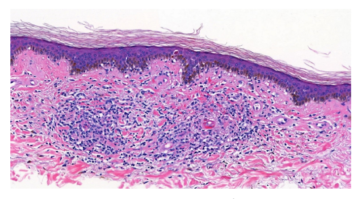
Figure 2 . Histopathology demonstrating focal lymphohistiocytic perivascular infiltrate and extravasated erythrocytes with subtle overlying interface. H&E, 20×.

topical corticosteroids as first-line therapy options [3-10]. Additional options include but are not limited to topical calcineurin inhibitors [11], phototherapy [6,12-14], pentoxifylline [15], rutoside/ascorbic acid [16], and colchicine [17,18].