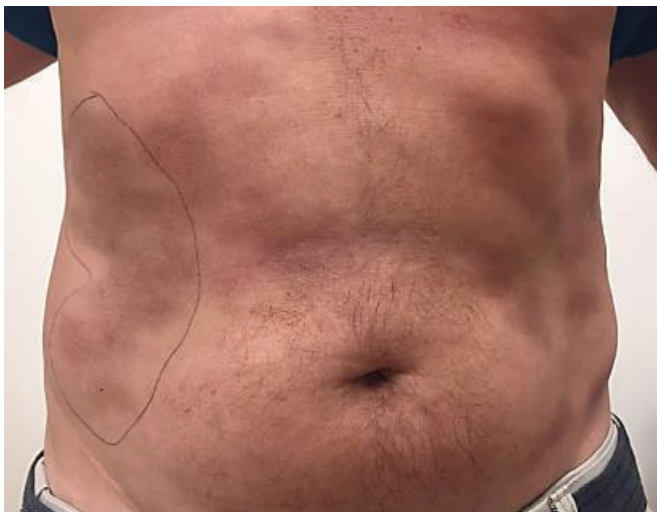
Figure 1. On the abdomen, flanks, and lower back, there were many, ill-defined, coalescing, erythematous-to-hyperpigmented, atrophic plaques, with overlying epidermal wrinkling and slight induration at the periphery

DISTRIBUTION: Abdomen, flanks, lower back, and feet