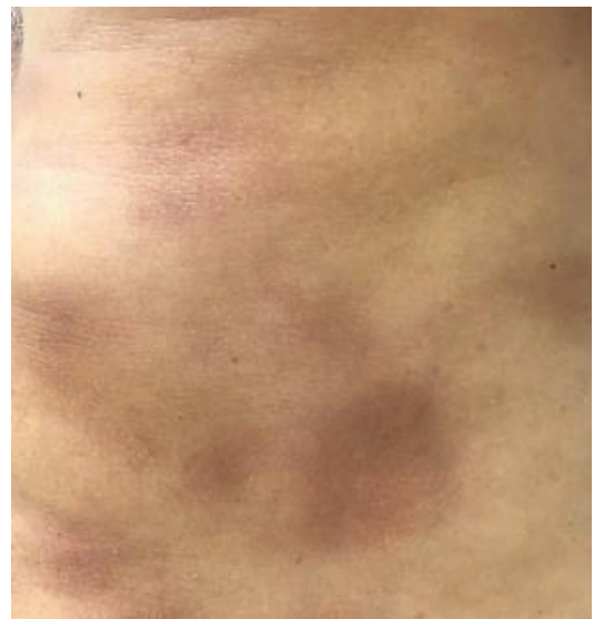
Figure 2. Ill-defined, coalescing, erythematous-to-hyperpigmented, atrophic plaques, with overlying epidermal wrinkling and slight induration at the periphery

HISTORY: A 53-year-old man was referred to the Skin and Cancer Unit for evaluation of an eruption on the abdomen and back. The patient first noticed the eruption in the summer of 2014. He denied associated symptoms, which included pruritus. He had been evaluated previously by two dermatologists and underwent two biopsies that showed a perivascular and interstitial dermatitis with eosinophils. He was treated with topical glucocorticoids without improvement. He continued to develop new lesions. Patch tests by a previous dermatologist showed positive reactions to p-phenylenediamine, nickel, isothiazolinone, and imidazolidinyl urea. There was no change in his eruption with avoidance of these allergens over several months. The clinical morphology of the lesions with hyperpigmentation, subtle atrophy, and epidermal wrinkling raised concern for possible morphea, specifically atrophoderma of Pasini and Pierini versus less likely mycosis fungoides. Two additional broad shave biopsies were obtained.