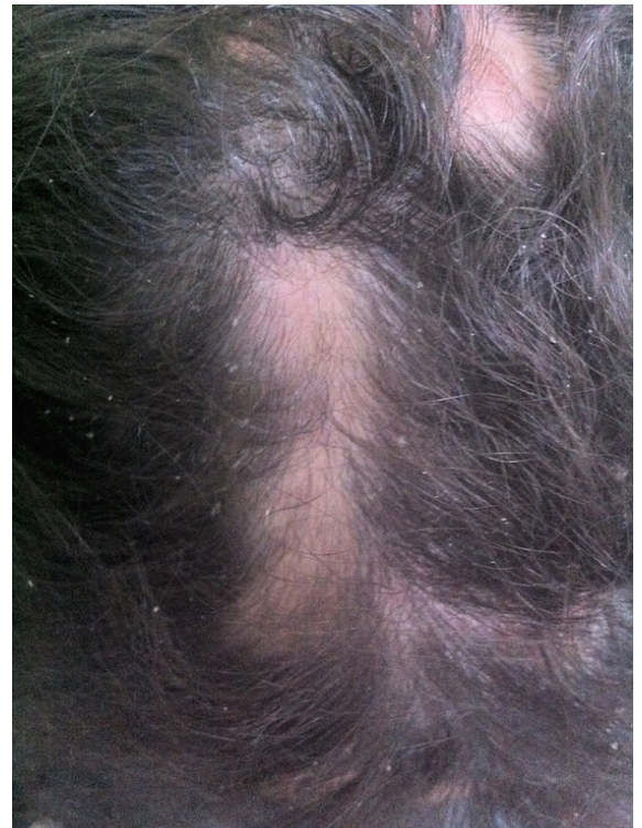
Figure 1. Alopecia patches associated with scalp erythema and psoriasiform scaling during adalimumab treatment.

A 24-year-old female with a 2-year history of fistulizing Crohn's disease (CD) was started on adalimumab monotherapy (40 mg biweekly) after failing to respond to various therapy regimens, including mesalazine, azathioprine and systemic corticosteroids. Seven months after treatment initiation she developed erythematous patches on the scalp that evolved with exudative discharge and progressive alopecia (Fig. 1). Subsequently several erythematous patches developed on the lower limbs, palms and soles. She denied personal or family history of psoriasis or alopecia. A skin biopsy obtained from the scalp revealed psoriasiform epidermal changes in association with alopecia areata-like changes in the dermis (Figs. 2-4). Periodic Acid-Schiff stain was negative for fungi. As CD was inactive, adalimumab was discontinued and daily treatment was started with topical clobetasol solution and coal tar shampoo. The scalp lesions cleared with complete hair regrowth within 2 months (Fig. 5). She is currently cleared of scalp lesions for 12 months, but presents occasional flares of scaly plaques on the plantar and internal malleolar regions.