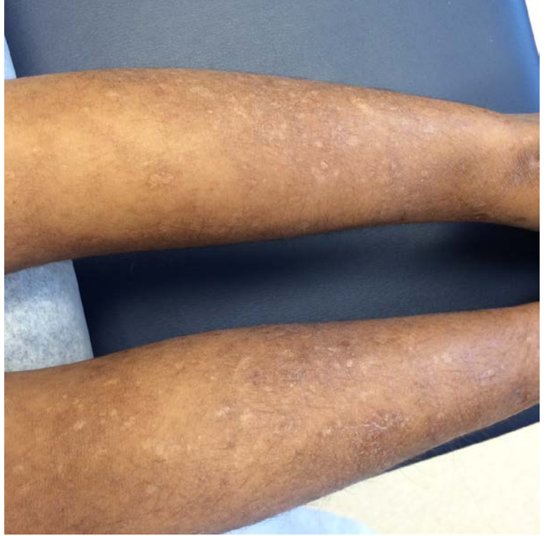
Figure 1 and Figure 2. Active lesions and varioliform scars on face and lower extremities