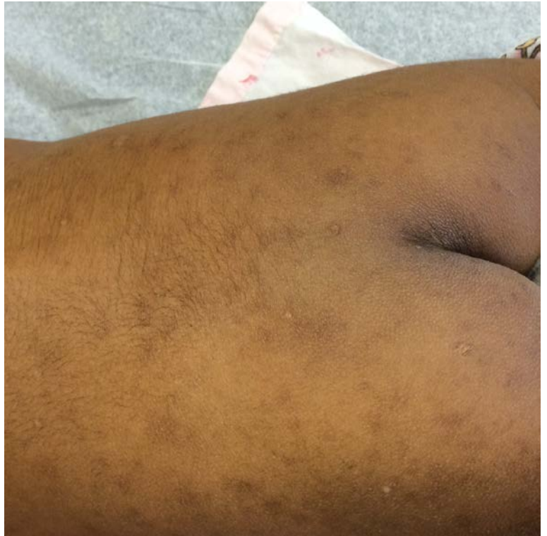
Figure 3 and Figure 4. Varioliform scars on back and buttocks