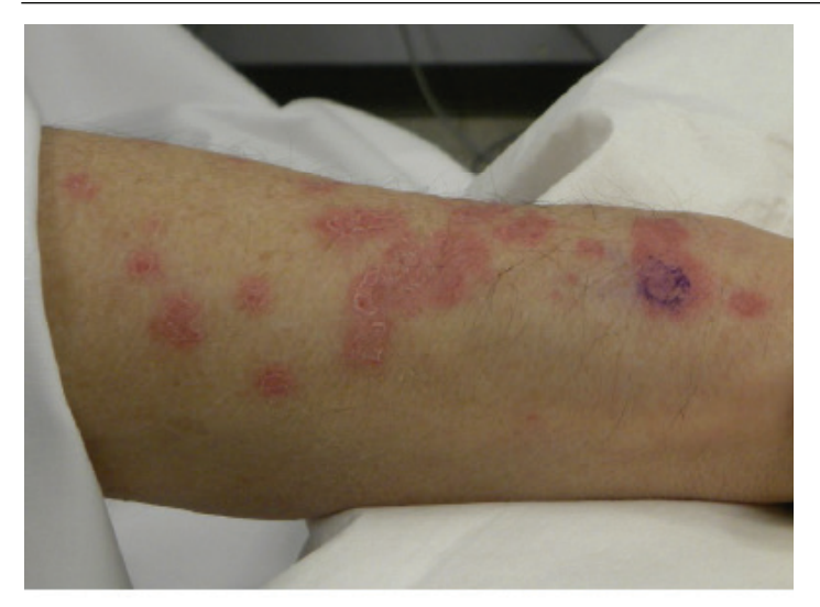
Figure 1: Capecitabine-induced lichenoid drug eruption on dorsal forearm.