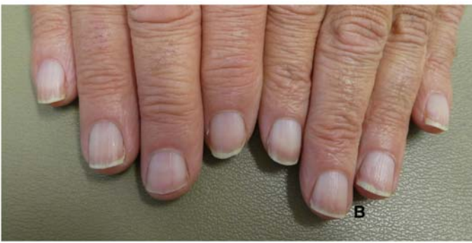
Figure 3 . The nails of the A) thumbs, and B) fingers of a 70-year-old heart transplant patient. The nail flag sign is present on the thumbs ( A ). There are white (arrows), red, white, and red horizontal bands present on the nail plate from the proximal nail fold to the distal tip of the nail. The fingernails of both hands ( B) show Terry nails and idiopathic polydactylous longitudinal erythronychia. The nail plates are white proximally (90% to 95%) with a red distal rim and there are single or multiple, narrow or broad, red linear streaks that extend from the proximal nail fold to the distal tip of the fingernails.

(23%, 17 of 81 individuals) than in paucibacillary leprosy patients (14%, 5 of 34 individuals). They postulated that more extensive vasculopathy in multibacillary leprosy patients contributed to the higher incidence of the flag sign in the nails of these individuals [1].