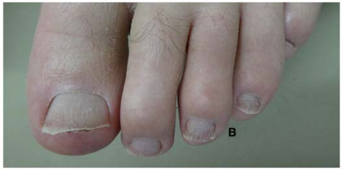
Figure 2 . The A) right and B) left foot of a 54-year-old heart transplant recipient show Terry nails. The proximal 90% to 95% of the nail plate is white with a small rim of red that composes the distal 5% to 10% of the nail plate.