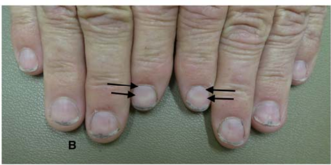
Figure 1 . The nails of the A) thumbs and B) fingers of a 54-year-old heart transplant patient demonstrate the nail flag sign. There are alternating white (arrows) and red horizontal bands on the nail plates. The dyschromia begins as a white band just distal to the proximal nail fold; subsequently, there is a red, a white, and another red transverse band on the nail plate. The black discoloration on his thumbnails is exogenous pigment acquired by working on his automobile prior to his dermatology appointment.

months after surgery. He also had gout. His daily medications included allopurinol, bumetanide, lisinopril, rivaroxaban, sirolimus, tacrolimus, and tamsulosin. He did not have alternating horizontal white and red bands on his fingernails or toenails prior to his heart transplant.