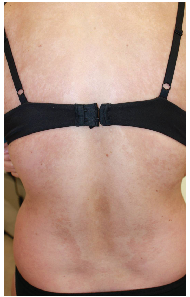
Figure 2. A broad plaque with mottled hyperpigmentation and hypopigmentation involves the lower back.