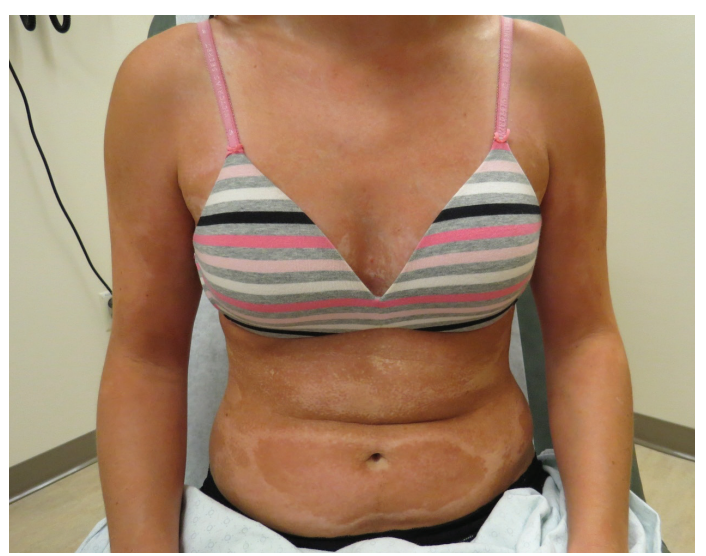
Figure 1. Hypopigmented and hyperpigmented, minimally indurated plaques are seen on the bilateral inferior neck, upper arms, chest, and abdomen.