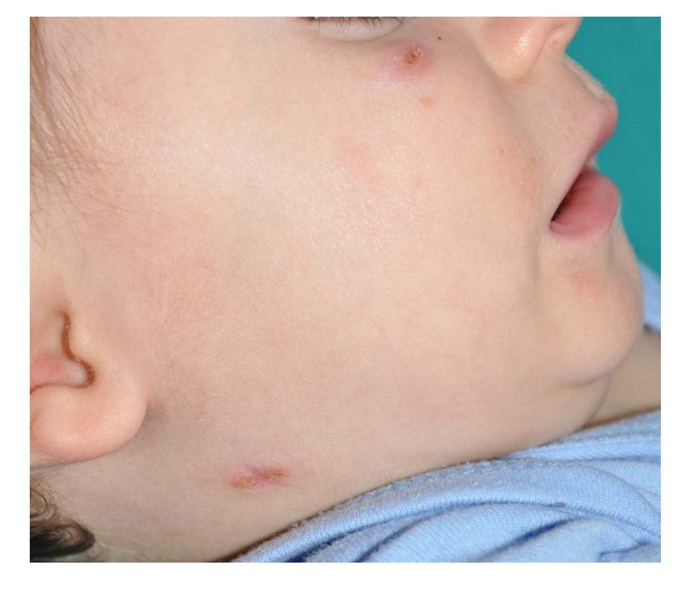
Figure 1. Two small red-yellowish papules on the lower right eyelid and the right submandibular area.

A 4 mm punch biopsy was performed; histologic findings are illustrated in Figures 2 and 3.