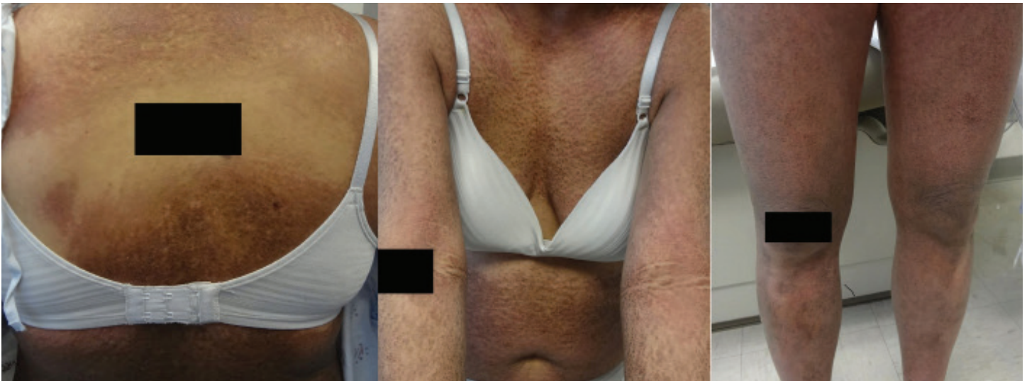
Figure 1. Hyperpigmented, reticulated, hyperkeratotic patches and plaques covering most of the patient's body surface area with notable sparing of a crescent shaped area on the back.

methotrexate (two months), mycophenolate mofetil (five months), azathioprine (six months), dapsone (one month), rituximab (two infusions), acitretin (two months), pentoxifylline (duration unknown), and ustekinumab (one injection). She was started on cyclosporine 3 mg/kg/d, which was increased after one week to 5 mg/kg/d. The patient had significant clinical improvement after five months of treatment under the higher dosage ( Figure 2 ). The patient discontinued cyclosporine after two years of treatment and has since remained in remission.