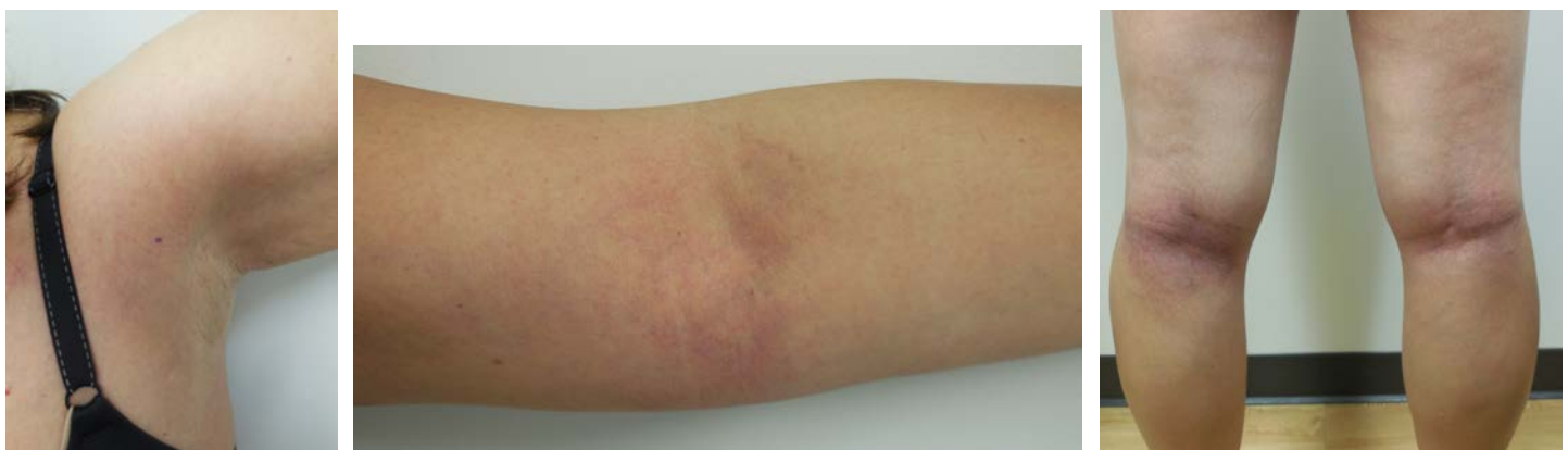
Figure 2. Asymptomatic erythematous patches of non-contact allergenic drug-induced baboon syndrome (also referred to as symmetric drug-related intertriginous and flexural exanthema or SDRIFE) on the left axilla. Figure 3. A close view of the left antecubital fossa shows macular