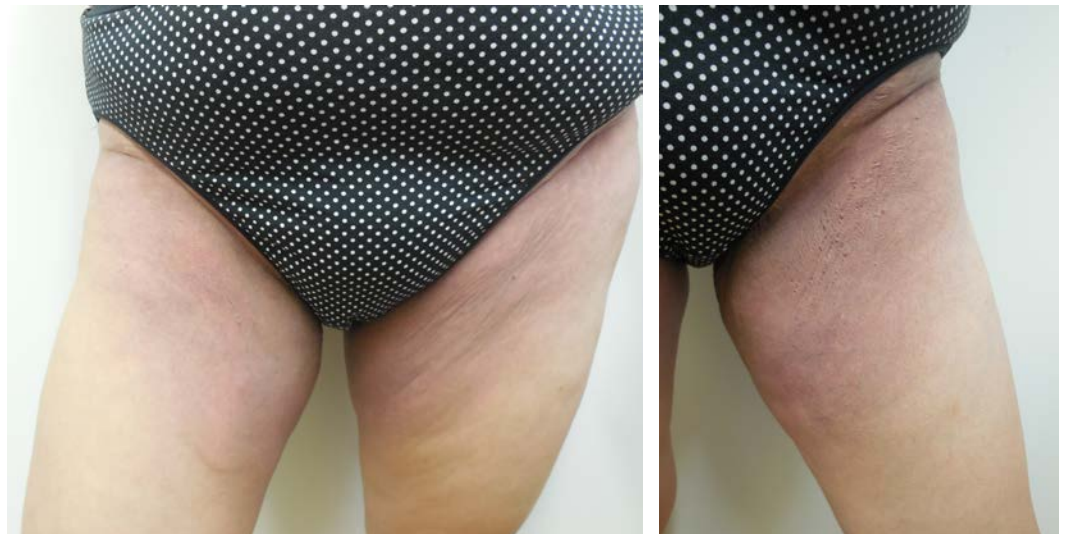
Figure 1 (a and b). Non-contact allergenic drug-induced baboon syndrome, in a 54-year-old woman with recurrent metastatic breast cancer, developed within 24 hours after receiving her first infusion of zoledronic acid. Distant (a) and closer (b) views of both (a) and left (b) inguinal regions and proximal medial thighs show asymptomatic patches of erythema.

Cutaneous examination, on Wednesday, September 10, 2014, showed a comfortable afebrile woman with non-tender, non-pruritic erythematous patches. There had been no further progression of her skin lesions and some of the affected areas were beginning to resolve spontaneously. Bilaterally affected areas included the inguinal region and proximal medial thighs (Figure 1), the axilla (Figure 2), the antecubital fossa (Figure 3) and the popliteal fossa (Figure 4). There was also macular erythema of the right flank. There were no lesions of mucosal membranes.