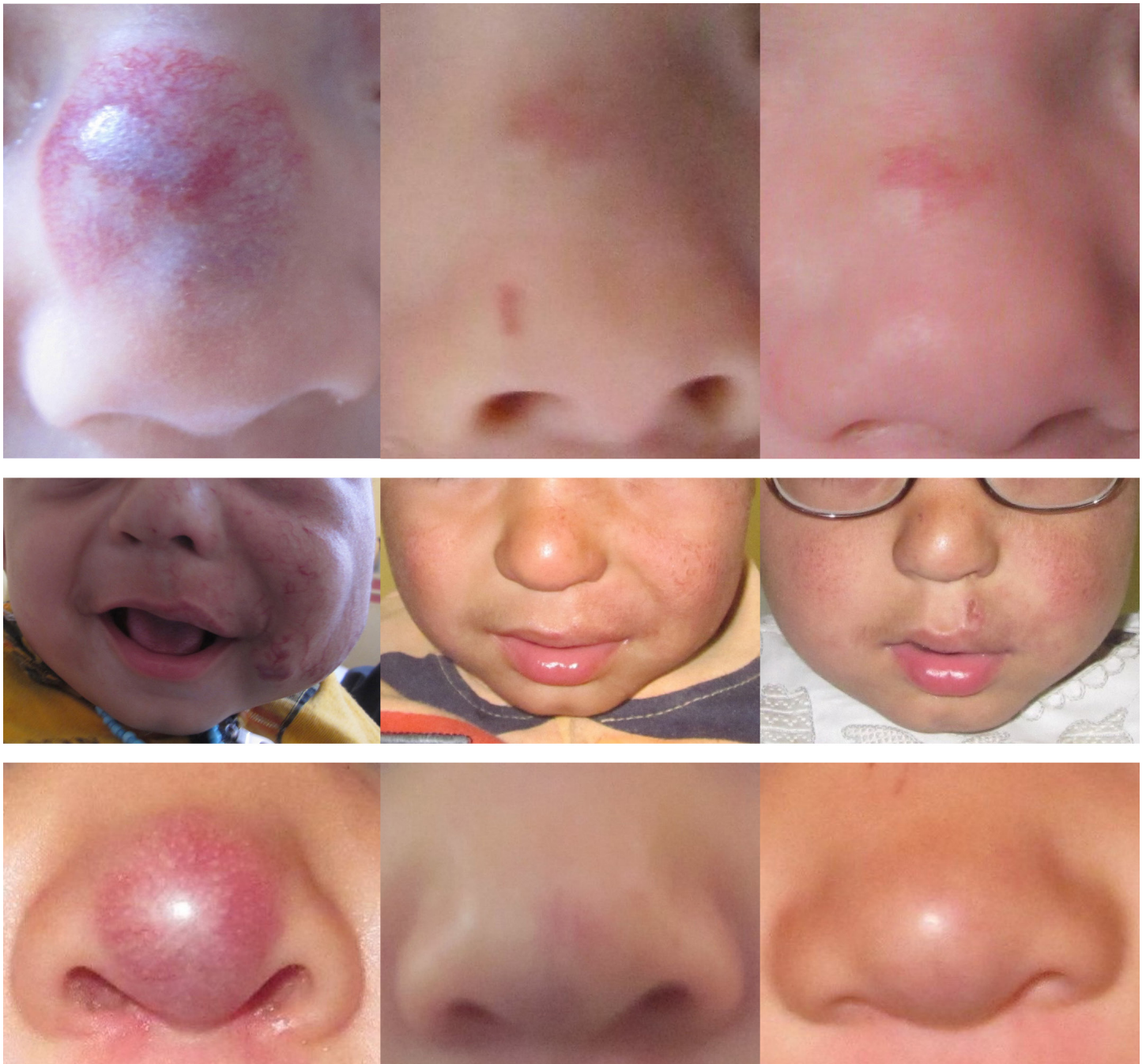
Figure 2. Three patients in the study at initiation of propranolol treatment and during treatment; the top patient was managed through teledermatology.

Additionally, six patients with small focal IH were started on topical timolol between 2014 and 2015. All had good response and no reported complications.