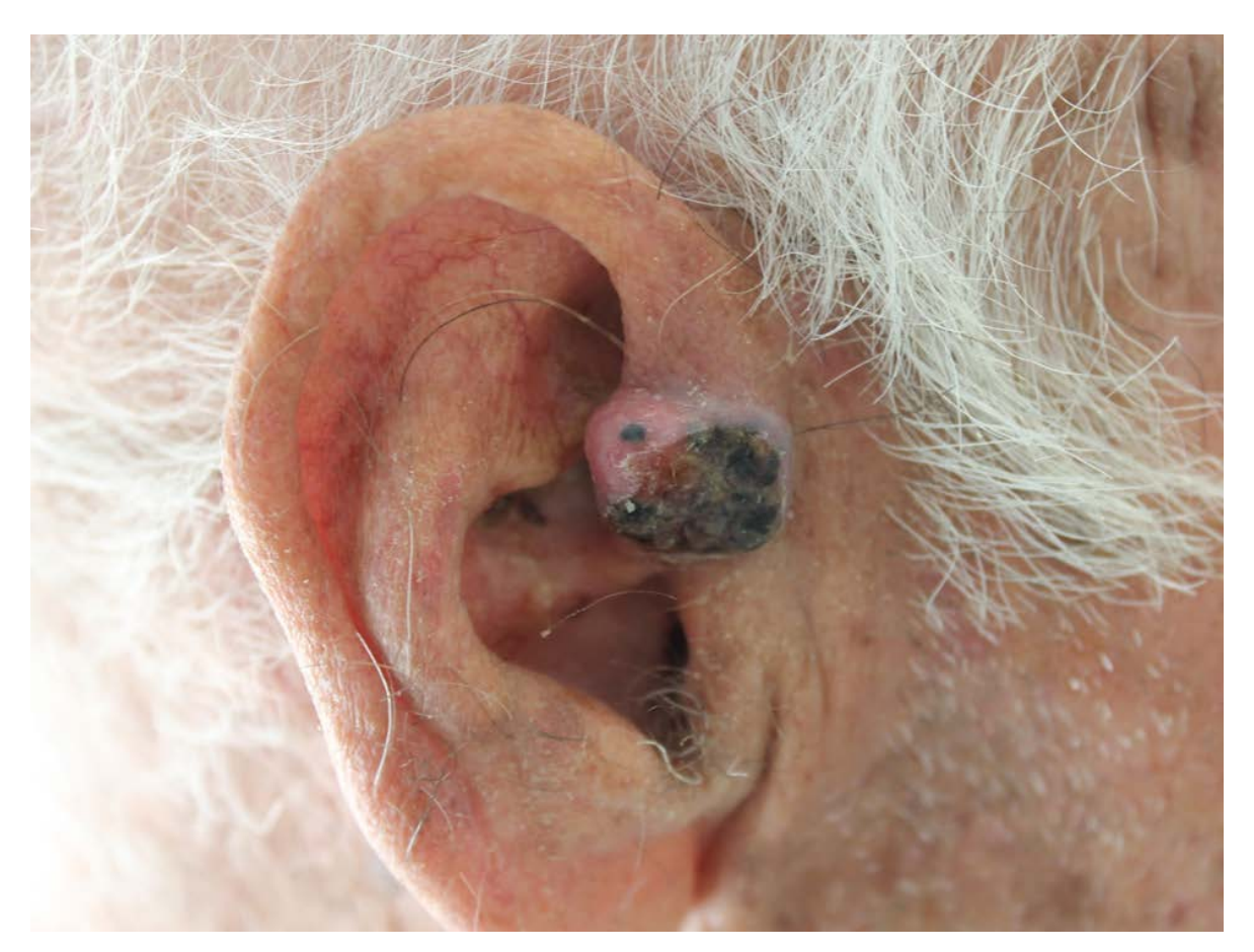
Figure 1. Ulcerated tumor located on the right preauricular area and the root of the right helix

Wide surgical excisión and closure with a transposition flap was perfomed. No evidence of recurrence has been noted at 12 months follow-up.