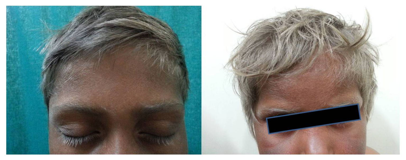
Figure 1. Eight year old male child with silver grey scalp hairs, eyebrows, and eyelashes since birth.