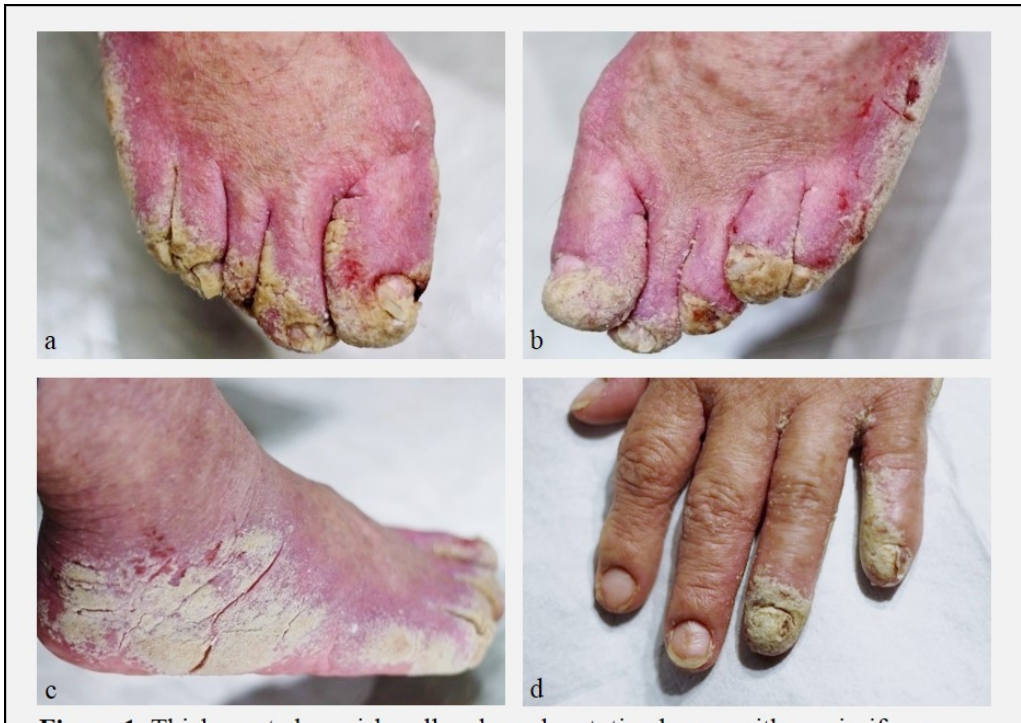
Figure 1 : Thick crusted grayish-yellow hyperkeratotic plaques with psoriasiform appearance, deep fissures and fine erythematous papules. a) right foot. b) left foot. c) right heel. d) left fingers.

A 46-year-old woman with a history of Down syndrome, eczema, bilateral cataracts, and seizure disorder presented as a new patient with a 13-month history of palmoplantar pruritus, erythema, and body rash that had originated at the hands and feet and had rapidly worsened in the last 4-6 weeks, becoming increasingly malodorous. During this 4-6 week period, family members also witnessed the patient scratching several regions of her body to the point of bleeding. Physical examination revealed thick crusted grayish-yellow hyperkeratotic plaques over the bilateral distal hands and feet with a psoriasiform appearance. There was full involvement of the nail plates, deep fissures on hands and feet, and fine erythematous papules disseminated over the arms, legs, neck, and face accompanied by excoriations in various stages of healing. The patient denied complaints of diaphoresis, tinnitus, syncope, diarrhea, dysuria, abdominal pain, headache, chills, anorexia, or insomnia. She was afebrile, with stable vital signs.