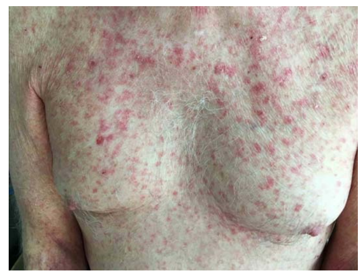
Figure 1 . Clinical image of rash due to enfortumab vedotin. Erythematous, scaly, pruritic papules on the chest and upper abdomen in a patient treated with enfortumab vedotin for metastatic urothelial carcinoma. Similar lesions were present on the back and extremities.

A man in his 70s with a history of metastatic urothelial carcinoma involving the right ureter, lymph nodes, and lungs presented to outpatient dermatology clinic for evaluation of a scaly, pruritic rash involving the torso and extremities. Two weeks prior to presentation he received an infusion of enfortumab vedotin as part of a phase I clinical trial. He subsequently developed the eruption within days of his first dose and noted minimal improvement with triamcinolone 0.1% cream. Of note, the patient was previously on a clinical trial of pembrolizumab, which was discontinued two