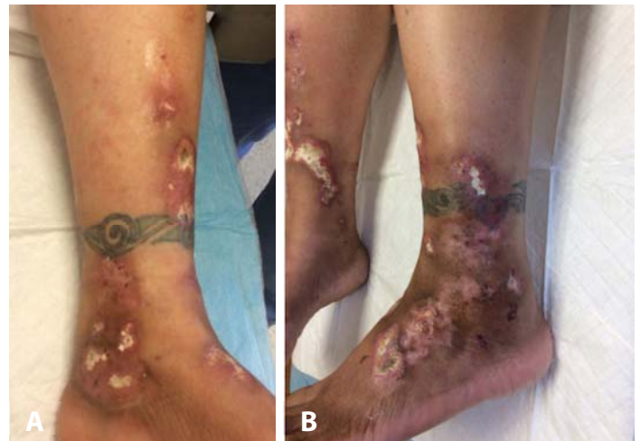
Figure 1. At the time of presentation, the patient had multiple, stellate ulcerated plaques on the bilateral lower extremities.

A 40-year-old woman presented to a local dermatologist with painful, stellate ulcerations on the bilateral lower extremities ( Figure 1 ). After failing treatments with antibiotics and prednisone, a punch biopsy was performed. The initial differential diagnosis was broad and included conditions characterized by vascular occlusion, such as inherited coagulopathies, platelet-related thrombopathies, hematologic malignancies, cryoglobulinemia, cryofibrinogenemia, infectious diseases, embolization, and immune-mediated vasculitides, as well as other common causes of leg ulcers, such as arterial disease, diabetes, neoplasms, vascular proliferations, and medications.