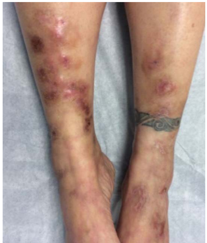
Figure 3 Four months after instituting aspirin, pentoxifylline, and dipyridamole, the patient's leg wounds healed with atrophic scars.

continued to have periodic ulcerations despite treatment with aspirin and pentoxifylline. With the addition of dipyridamole, her skin lesions healed with atrophic scars and she has not had any new ulcerations for well over one year ( Figure 3 ).