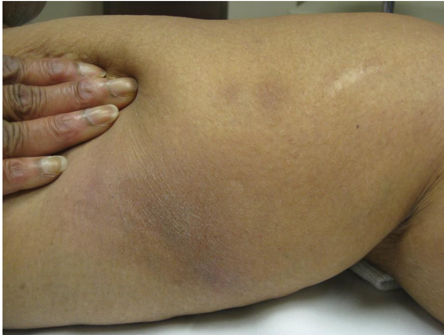
Figure 3. Ill-defined erythematous indurated nodules seen at second visit.

At her visit three months later, the smaller papules and pustules had resolved with oral doxycycline, but the larger, ill-defined, firm, tender erythematous nodules were still present and were suspicious for panniculitis mimicking erythema nodosum (Figure 3).