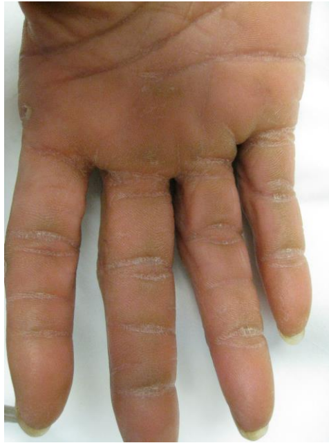
Figure 1. Hyperkeratotic papules in areas of pressure and friction with mild desquamation seen with hand-foot skin reaction

A 60-year-old woman with a history of GIST with metastases to the peritoneum currently being treated with regorafenib presented with multiple calluses and thickening of her palms and soles. Prior to starting the chemotherapy, she denied any similar eruptions. On physical exam, the patient had hyperkeratotic yellow, scaly plaques covering bilateral palms and soles. Within the plaques, a few 2-8 mm focal hyperkeratotic thick papules were identified and ill-defined superficial desquamation was observed (Figure 1).