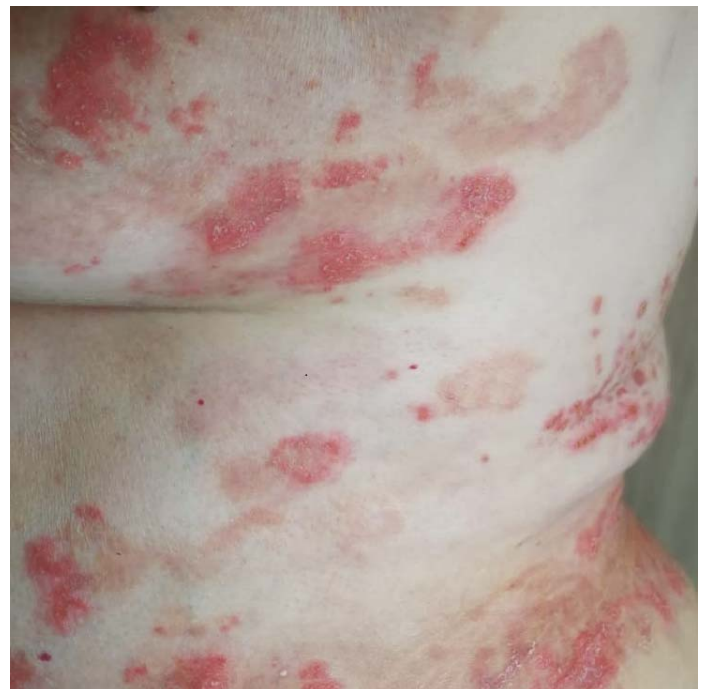
Figure 1: Lesions mimicking pustular dermatoses on the trunk.

An 89-year-old woman presented with plaques, accompanied by pustules and desquamation on the back and front of the trunk for approximately one year ( Figure 1 ). Long term use of potent topical corticosteroid had been ineffective. Because of the chronicity, the diagnoses of subcorneal dermatosis or subcorneal pustular dermatosis type of IgA