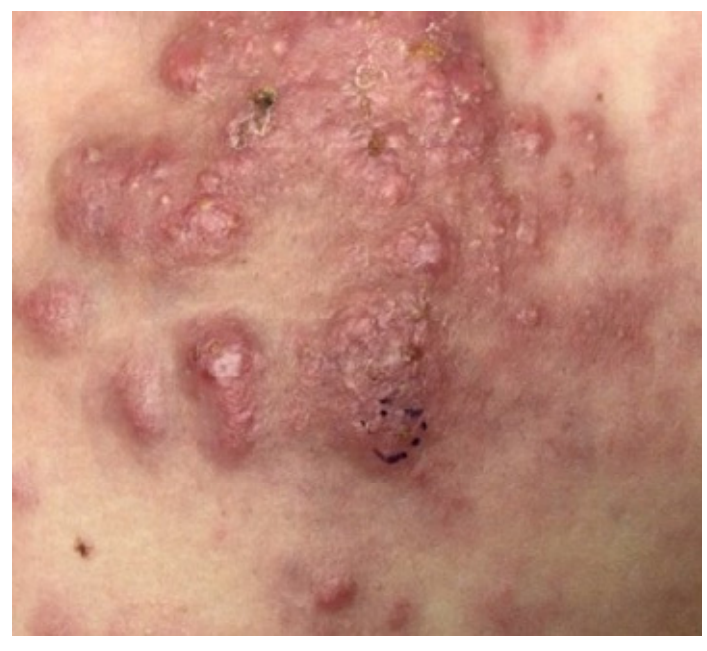
Figure 1. Clinical morphology: red-to-purple painful nodules and papules coalescing into plaques studded with pustules and overlying honey-colored crust.

and reported worsening over time. On examination, the patient had red-to-purple-colored nodules and papules, coalescing into plagues which were studded with pustules and honey-colored crust ( Figure 1 ). She also had significant edema involving the entire right lower extremity. Punch biopsy of a nodule revealed aggregates of epithelioid cells with clear ductal differentiation that were CK7+, CK20-, PAX8+ (Figure 2). Histopathology immunostaining of the skin biopsy were consistent with metastatic carcinoma favoring a primary gynecological malignancy. The patient was referred to the oncology department and a whole-body PET CT was performed. This revealed extensive widespread hypermetabolic lymphadenopathy