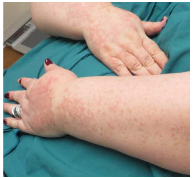
Figures 1,2. Erythematous papules and plaques, some in annular array.