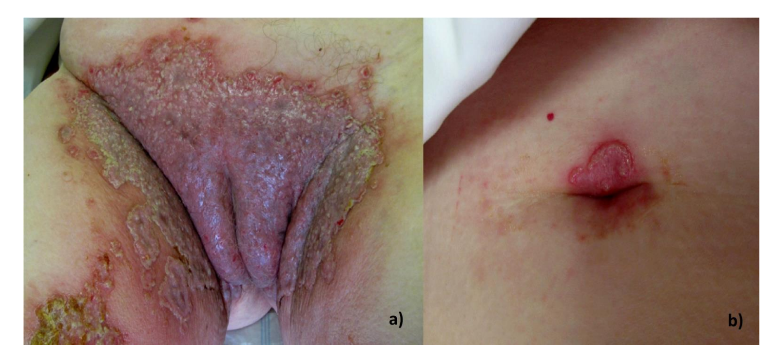
Figure 1 . Vegetating pustular exudative plaques on the vulva with extension to the internal face of the thighs (a) and the periumbilical region (b).

A 79-year-old woman, previously healthy, was observed for a painful eruption of the vulva with 3 months of evolution. She completed multiple antibiotic courses without improvement. On physical examination, she presented with well defined vegetating pustular exudative plaques on the vulva with extension to the inner thighs and the periumbilical region (Figure 1). She had no lesions on oral or vaginal mucosae.