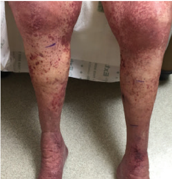
Figure 1. Blanching purpuric macules coalescing into patches with focal hemorrhagic vesicles on medial lower legs.