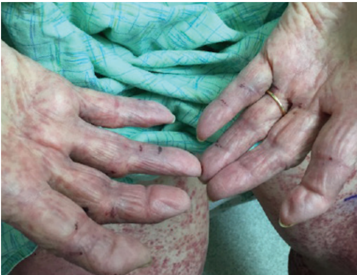
Figure 2. Purpuric macules coalescing into patches on palms.

developed a presumed infection at the inguinal catheterization site for an inferior vena cava (IVC) filter placement. No bacterial culture was performed at the time of antibiotic initiation. A ten-day course of trimethoprim-sulfamethoxazole 800 mg-160 mg 1 tab PO bid (TMP-SMX) was started. Two days after she received TMP-SMX, purpuric macules and thin papules erupted on her feet and spread over the course of the following 6 days proximally to her thighs, trunk, and arms, leading to her admission.