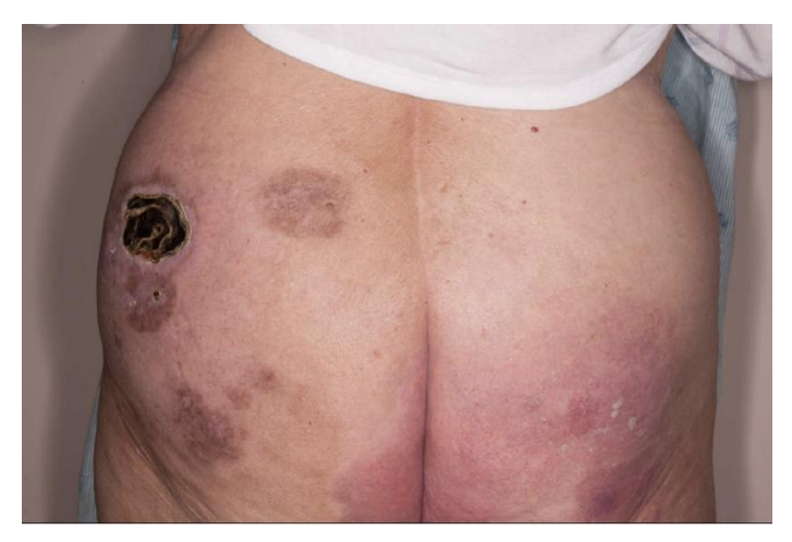
Figure 3 . Improvement of the left buttock tumor after radiation therapy.

with improvement ( Figure 3 ). One month later, she restarted oral bexarotene at 300mg/day, topical bexarotene 1% gel, and clobetasol 0.05% cream. A PET-CT scan showed a decrease in size of the patient's lung mass and numerous new cutaneous nodules of the back and groin. Her BSA was noted to be 3.9% patches, 0% plaques, and 3.75% tumors. Pralatrexate 15mg/m<sup>2</sup> once weekly × three weeks out of four was added two months after radiation but was discontinued with bexarotene a month later because of the development of several tumors on her bilateral arms, legs, and trunk that degraded to