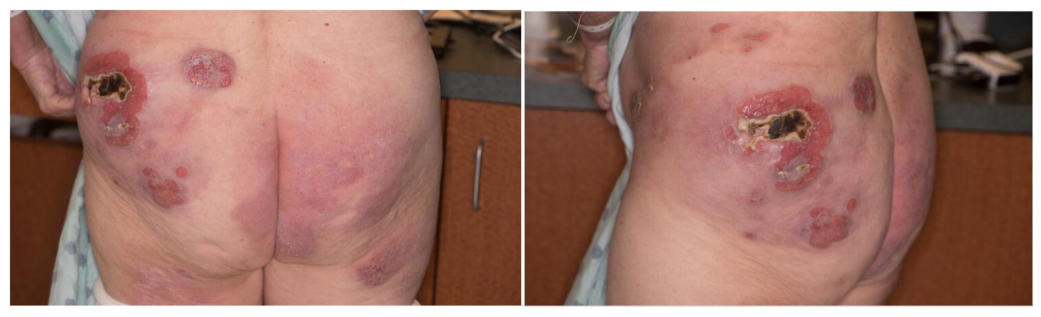
Figure 1 . Progression of disease with ulcerated tumor of the left buttock, scattered erythematous patches and edematous plaques of the buttocks and flanks.

phenotype. Her skin lesions initially improved with psoralen plus UVA photochemotherapy (PUVA), but PUVA was discontinued after 7 months due to cutaneous burning. Topical bexarotene 1% gel triamcinolone 1% cream resolved most lesions.