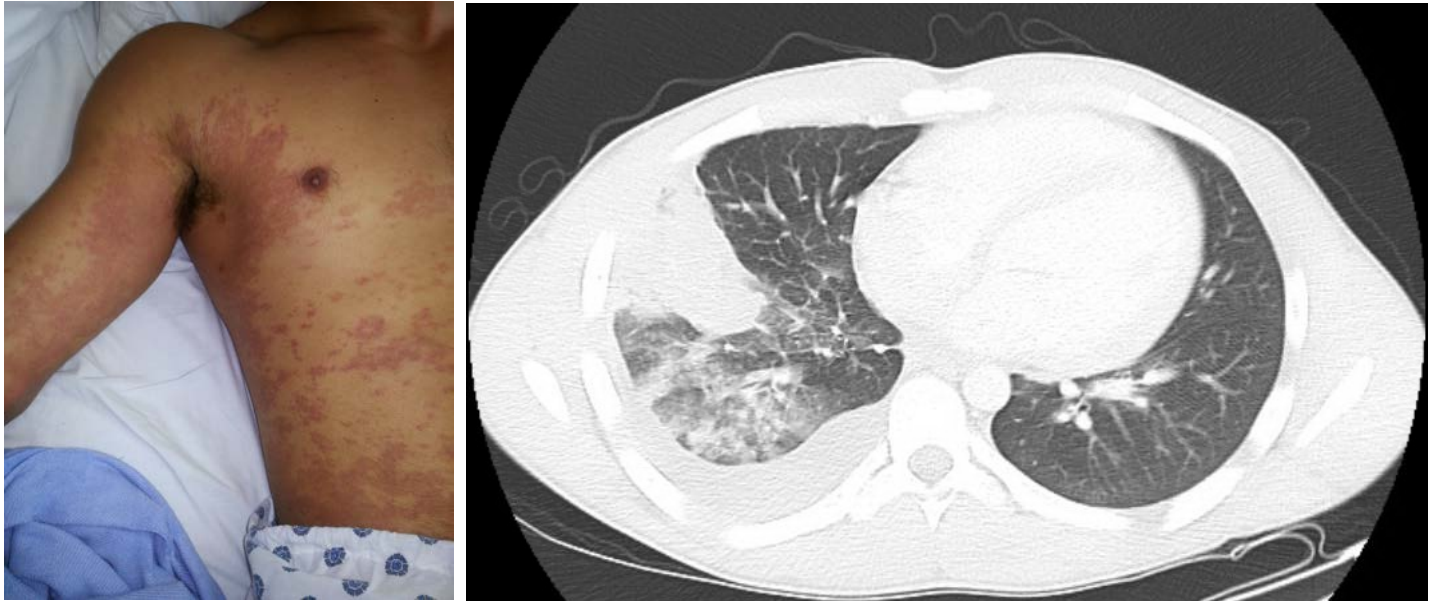
Figure 1. Erythematous plaques of superficial exfoliation noted in flexural areas of the upper extremities and flank. Figure 2. CT scan demonstrating right middle and lower lobe infiltrates and consolidation

On physical examination, brightly erythematous plaques of superficial exfoliation were noted in flexural areas of the upper extremities and flank with discrete collarettes of scale on the scalp. At the time of dermatology consultation, few clinically discernable intact pustules remained.