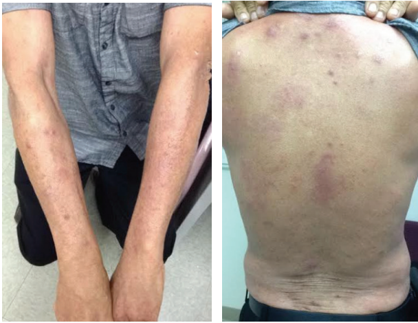
Figure 1. Patient's arms (left) and back (right) prior to treatment with apremilast showing generalized erythematous and lichenified plaques.