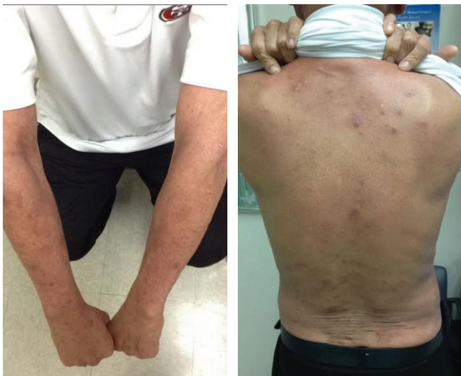
Figure 2. Patient's arms (left) and back (right) 10 weeks into treatment with apremilast. Decrease in erythema, but persistent hyperpigmentation and lichenification are observed.

overlying excoriations on face, neck, arms, back, and legs ( Figure 1 ). There was patchy hair loss on his scalp. The decision was made to start the patient on apremilast 30 mg BID. Topical treatments remained unchanged. Four weeks into apremilast therapy, the patient noted subjective improvement in pruritus. There were some visual signs of improvement on skin examination. Ten weeks into apremilast therapy, substantial decrease in erythema was observed, but with persistent hyperpigmentation and lichenification ( Figure 2 ). There was also stabilization of hair loss and some hair regrowth of the scalp. Of note, the patient complained of occasional nausea and gas that was tolerable and decreased over time.