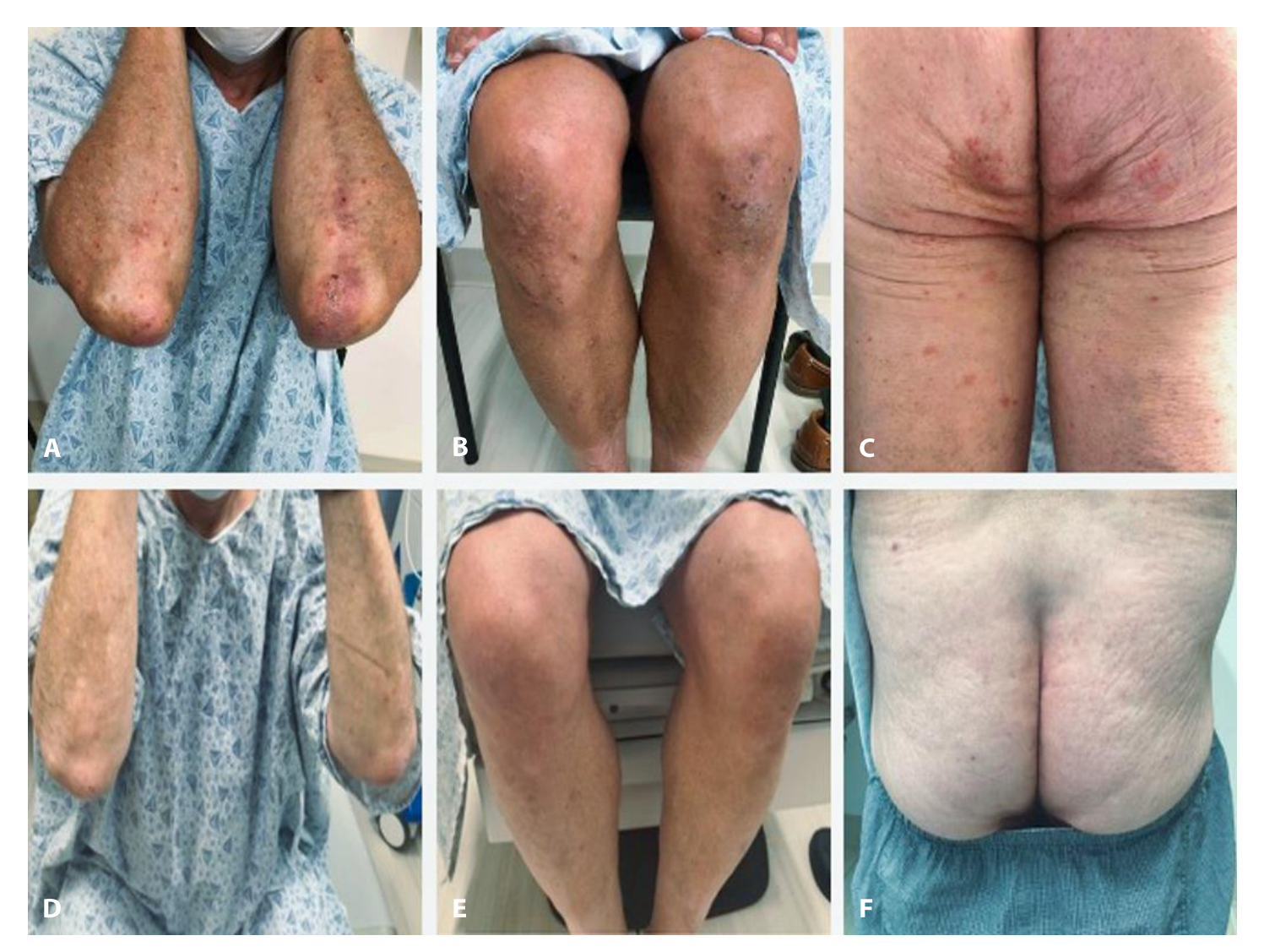
Figure 1. A-C) Dermatitis herpetiformis pre-treatment. Excoriated pink papules and intact small vesicles with clear-yellow fluid on an erythematous base scattered on the extensor forearms, lower extremities and buttocks. D-F) Dermatitis herpetiformis post-treatment. Clearance in areas of prior skin involvement 7 months after treatment with tofacitinib 5mg twice daily.

neutrophilic microabscesses at the dermal papilla as well perivascular as lymphocytic sparse 2). inflammatory infiltrate (Figure Direct immunofluorescence showed 2+ granular IgA staining of the basilar layer of epidermis and the tips of dermal papillae. Unique to these histologic findings is linear granular IgA, a finding seen in linear IgA dermatoses but also DH patients with glutensensitive enteropathy [4]. Laboratory workup revealed elevated tissue transglutaminase IgA levels at 153.0 units with no evidence of IgA deficiency. The patient tried oral dapsone which led to rapid improvement but was discontinued after developing a dapsone-hypersensitivity syndrome. He also failed