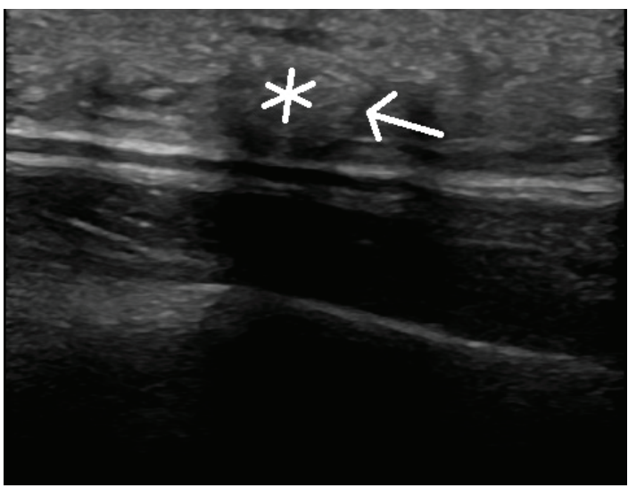
Figure 2. (Top) Isoechoic and hyperechoic nodular structures in the subcutaneous tissue (arrow) generating a posterior acoustic shadow artifact (asterisk), and mixed hyperechoic and hypoechoic areas in the subcutis (star). (Bottom) Isoechoic subcutaneous nodule (asterisk) surrounded by a hypoechoic rim (arrow).

about 3 cm on the lateral aspect of the right leg, with neither ulceration nor visible inflammatory signs on the skin ( Figure 1 ). Palpation allowed appreciation of similar smaller nodules in the surrounding skin. On the lateral aspect of the contralateral leg we found a similar subcutaneous nodule of approximately 1 cm. The patient had a history of gout diagnosed 10 years before, with frequent attacks of gouty arthritis. He had been taking allopurinol 300 mg daily and colchicine during attacks for years, without medical control. He had tophi on his elbows and on his right foot. The patient denied excessive alcohol intake. He had a history of smoking until two years before presentation, and had a family history of gout.