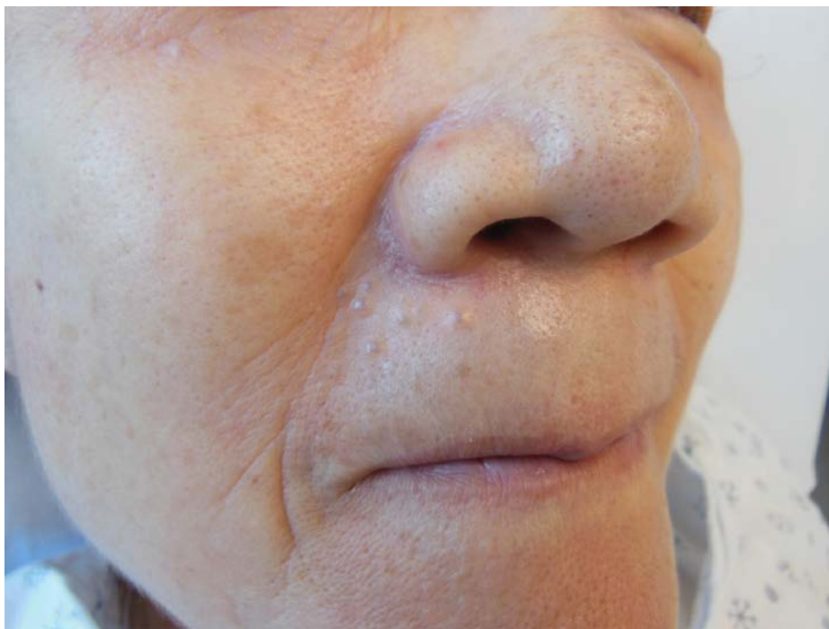
Figure1. Multiple blue-grey, translucent papules on the cheeks and upper cutaneous lip

A 53-year-old woman presented with 10 to 15-year history of multiple asymptomatic papules on the face. Physical exam disclosed approximately 20-30 translucent blue-grey papules on the cheeks, melolabial folds, and the upper cutaneous lip (Figure 1). Shave biopsy was performed. Histopathologic examination revealed unilocular cystic spaces lined by eccrine epithelium with two layers of cuboidal cells (Figures 2 and 3).