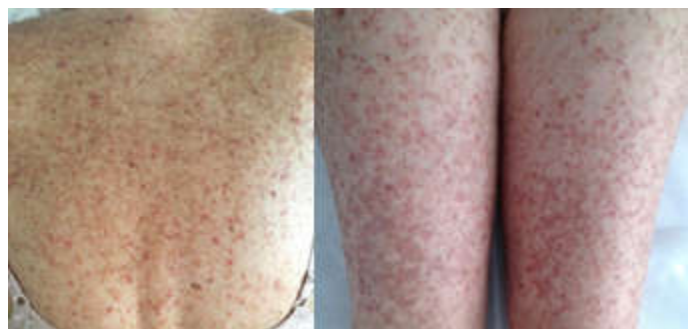
Figure 1. Brownish hyperkeratotic papules and papulovesicles on the back and the lower extremities prior to onset of acitretin monotherapy.

In the last three decades, the dramatic efficacy of oral acitretin (representative of the second retinoid generation) in the systemic treatment of severe and recalcitrant keratinization disorders has been established in numerous clinical trials [5]. In contrast to its usually mild mucocutaneous side effects, which are common or relatively common, the systemic adverse reactions of acitretin are uncommon or rare and include teratogenicity, hyperlipidemia, hepatotoxicity, intracranial hypertension, myopathy, and peripheral neuropathy [6].