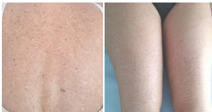
Figure 3. Clinical aspect of the back and the lower extremities of the patient subsequent to six weeks of acitretin monotherapy.