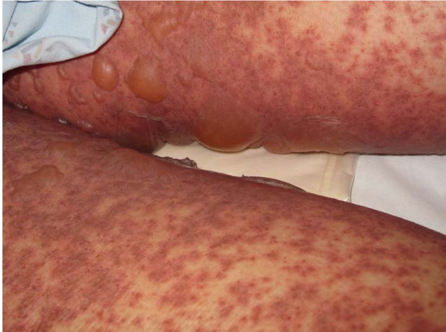
Figure 1. Tense blisters on a background of dusky red macules and plaques located on the thighs of a 67-year-old woman on the day of hospital consultation

Physical examination revealed diffuse 2-10mm round to oval atypical targets with dusky red centers coalescing into red-brown dusky plaques on the torso and thighs. She also had tense blisters on the back, axillae, and thighs (Figure 1), some of which had ruptured resulting in painful denuded skin (Figure 2). There was no mucosal involvement, but the patient was febrile. The body surface area involved at presentation was ~35%. Clinical suspicion was high for toxic epidermal necrolysis.