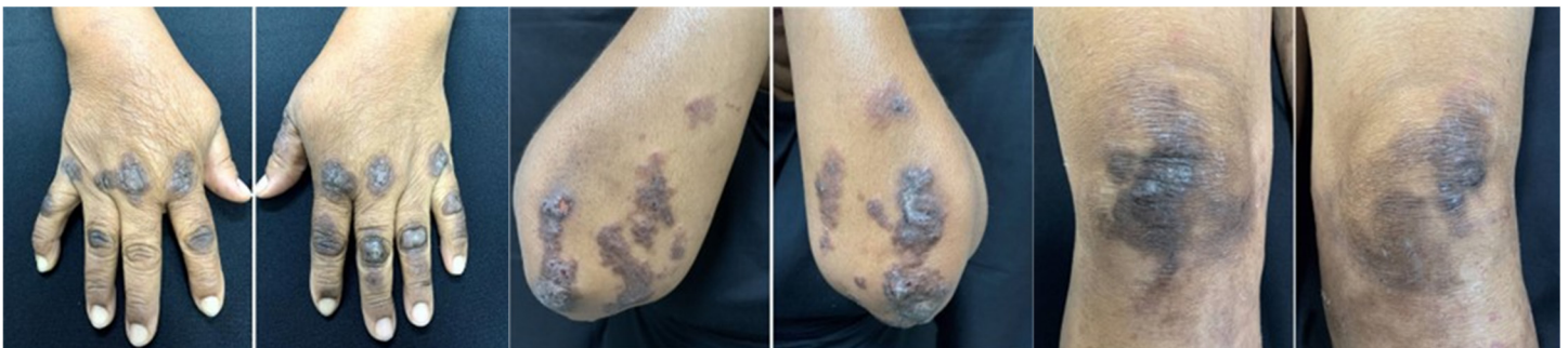
Figure 1 Violaceous papules and nodules involving the extensor surface of the hand. Indurated violaceous papules and plaques involving the elbow. Violaceous plaques involving the extensor surface of the knees.

We report a 65-year-old woman, who presented with painful and itchy lesions on her elbows, hands, knees, and feet for a year. She reported that after four months they progressed to focal ulcerations and were associated with arthralgia. She denied fever or other systemic symptoms. She had a previous history of arterial hypertension, diabetes, and rheumatoid arthritis for 45 years. She was taking methotrexate 20mg per week and prednisone 5mg per day. On dermatological examination she exhibited violaceous infiltrated plaques, some ulcerated, with clear margins and irregular contours. The plaques varied from 2 to 10cm and were located symmetrically on the hands, elbows, knees, and legs ( Figure 1 ).