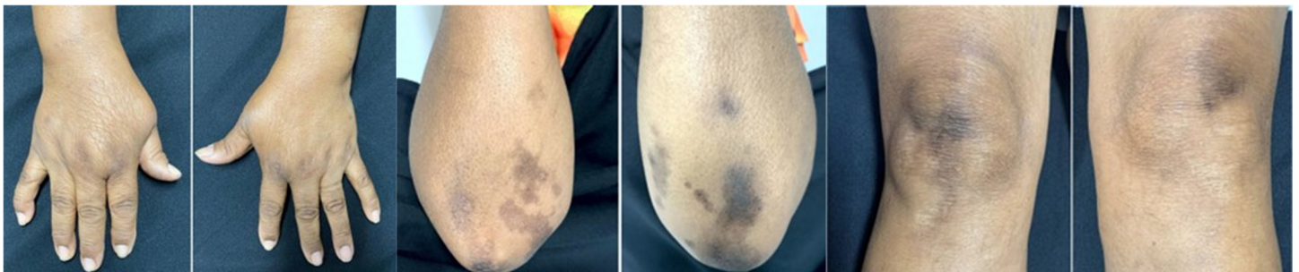
Figure 3. Residual postinflammatory hyperpigmentation of hand, elbow, and knee lesions after two weeks of dapsons therapy.

Regarding autoimmune diseases associated with EED, there are reports of association with systemic lupus erythematosus, rheumatoid arthritis [6,7], Wegener granulomatosis, and polychondropathies.