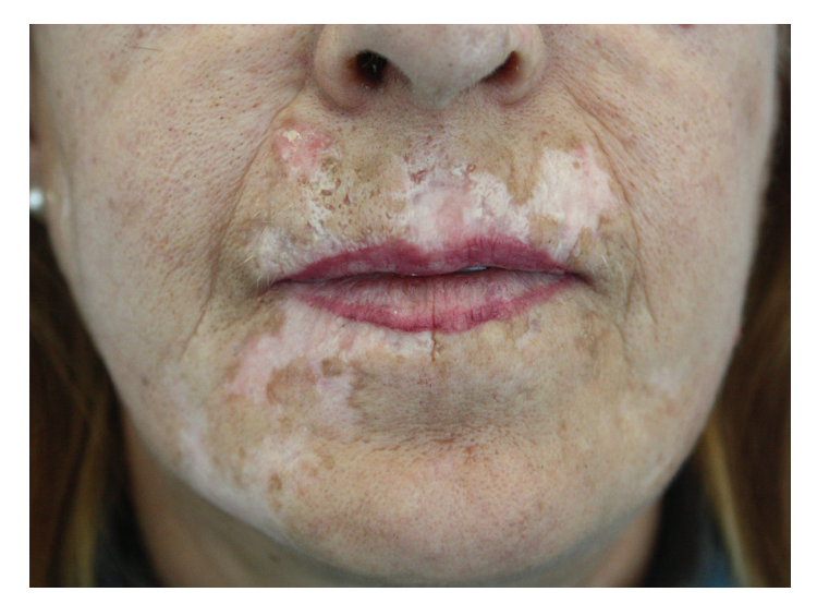
Figure 3. DLE three years after ustekinumab, in May 2015. Cicatricial plaques around the mouth with little active inflammation.

of poor results. Methotrexate associated with mycophenolate mophetil was not effective. In March 2012 ustekinumab was started. It was administered as 45 mg at weeks 0, 4, and then every 12 weeks, while she was still taking methotrexate.