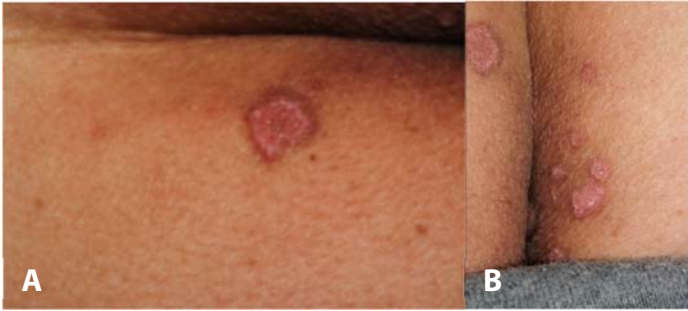
Figure 1. A) Hyperkeratotic, oval plaque with scaling characteristic of porokeratosis ptychotropica. B) Satellite lesions in various stages on the right gluteal cleft.

liquid nitrogen cryotherapy with improvement in both appearance and symptoms.