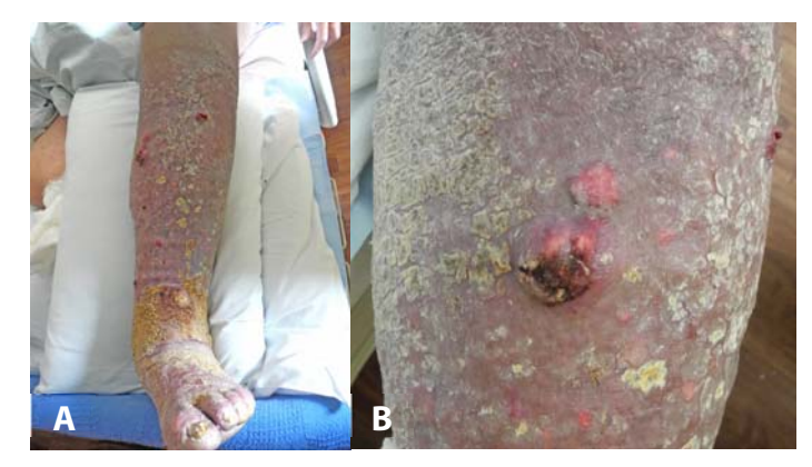
Figure 1. A) Left lower extremity demonstrating a diffuse violaceous, yellow-brown coalescing hyperkeratotic plaques, ulcers, and exophytic violaceous nodules on the anterior and medial surfaces. B) Close-up photograph of the left shin demonstrating an ulcerated, violaceous nodule.

Computed tomography scans of the head, neck, chest, and abdomen/pelvis demonstrated splenomegaly and multiple non-enlarged paraaortic and iliac lymph nodes. A bone marrow biopsy was negative for a hematolymphoid malignancy. A skin biopsy was performed ( Figure 2 ) and found