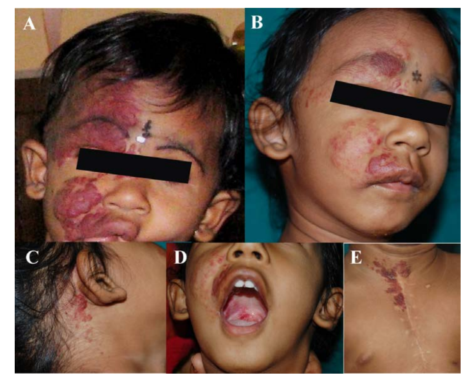
Figure 1. A large segmental facial haemangioma involving the right frontotemporal and maxillary segments at one year (A) and (B) showing mild regression at two and a half years of age. Haemangioma involving the retroauricular area (C), palate (D) neck and sternal area (E). Post-operative scar following sternal repair (E)