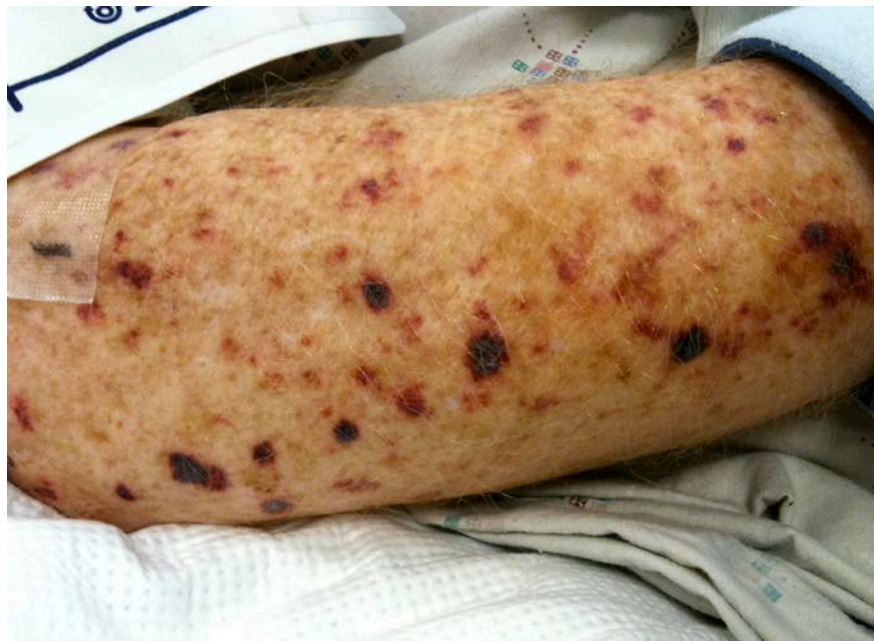
Figure 1: dark red macules, purpuric papules, and occasional hemorrhagic vesicles

Microscopic findings: Histopathologic examination of the biopsy specimen from the right forearm (Figure 2 and Figure 3) revealed partial to full thickness epidermal necrosis with subepidermal separation and numerous extravasated red blood cells in the papillary dermis. In areas of intact epidermis, basilar keratinocytes with enlarged pleomorphic nuclei were noted. Marked solar elastosis was present. There was no evidence of vasculitis.