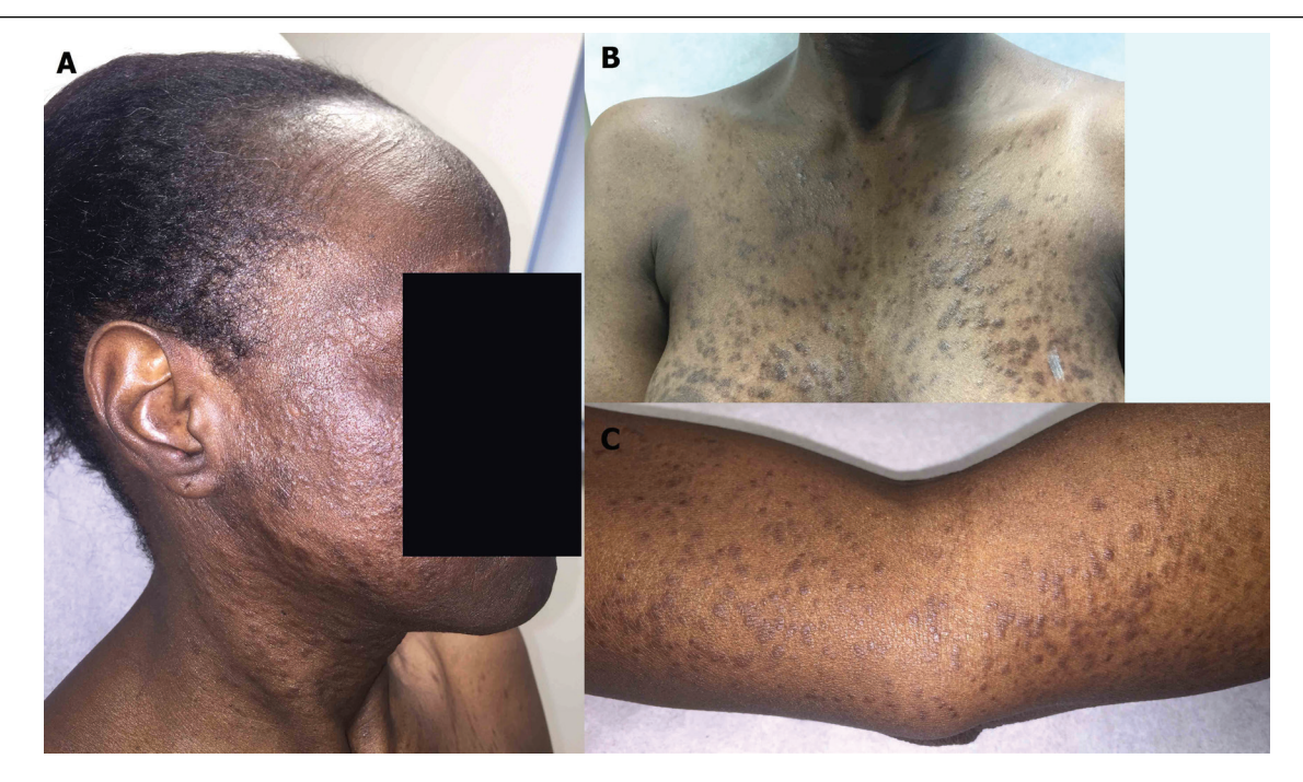
Figure 1. A ) Numerous skin-colored to slightly pigmented papules are shown on the face and anterior neck. B) Larger, distinct hyperpigmented oval brown papules on the anterior chest. C) Smaller hyperpigmented papules on the arms.

were also found on the arms and legs, though more sparsely distributed ( Figure 1 c). She had larger distinct hyperpigmented oval brown papules on the anterior trunk ( Figure 1 b). Darier sign was negative. The lower extremities were relatively spared, as were the ears, nasal rim, oropharynx, and lips. A biopsy was performed.